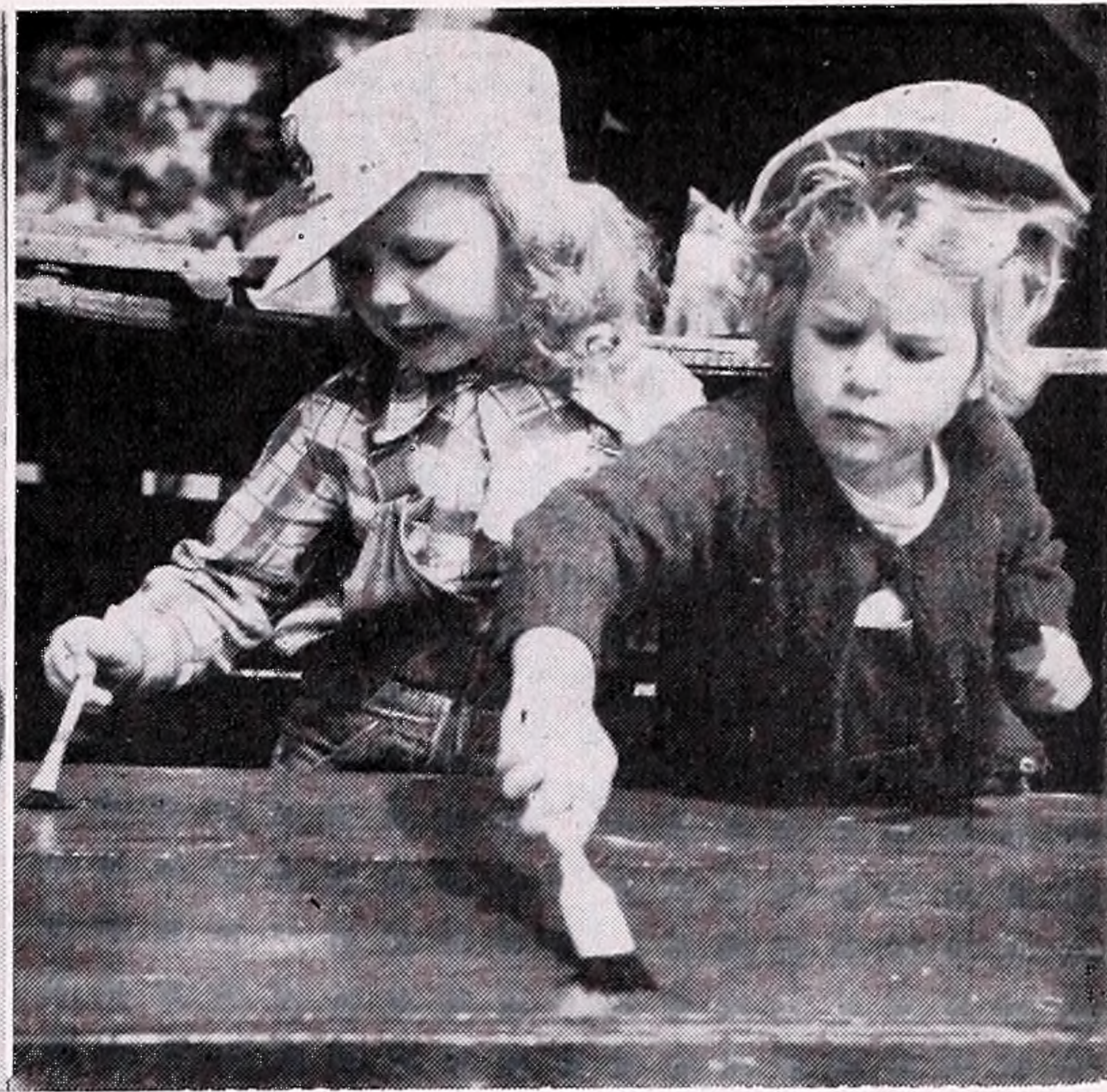
Left: "A Trip to the Dentist"—Right: "Painting With Water"