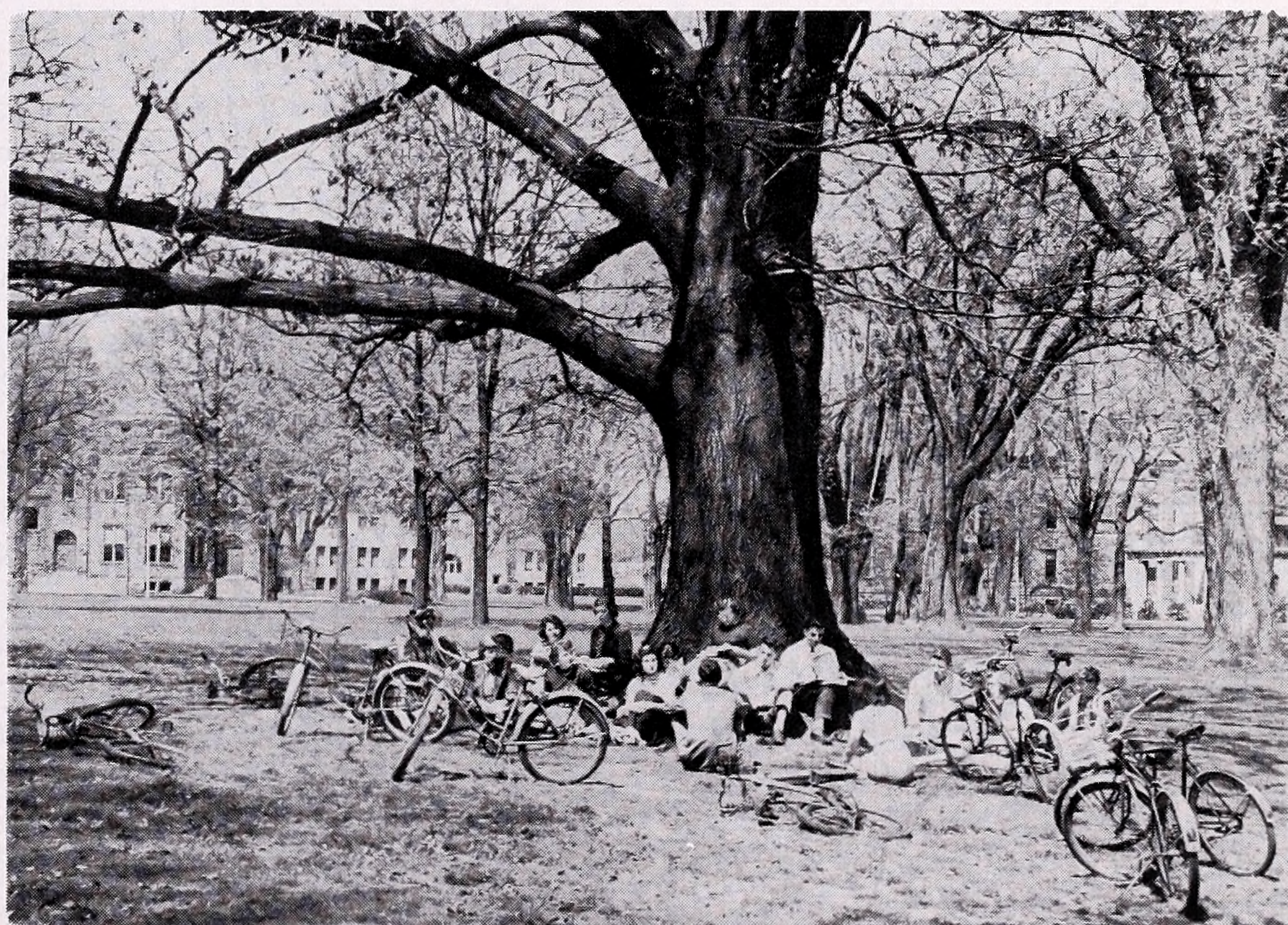
Oberlin College students on Tappan Square on campus

However diverse our methods, it seems to me that the aims of liberal arts colleges are pretty much the same. We are interested in the prob-