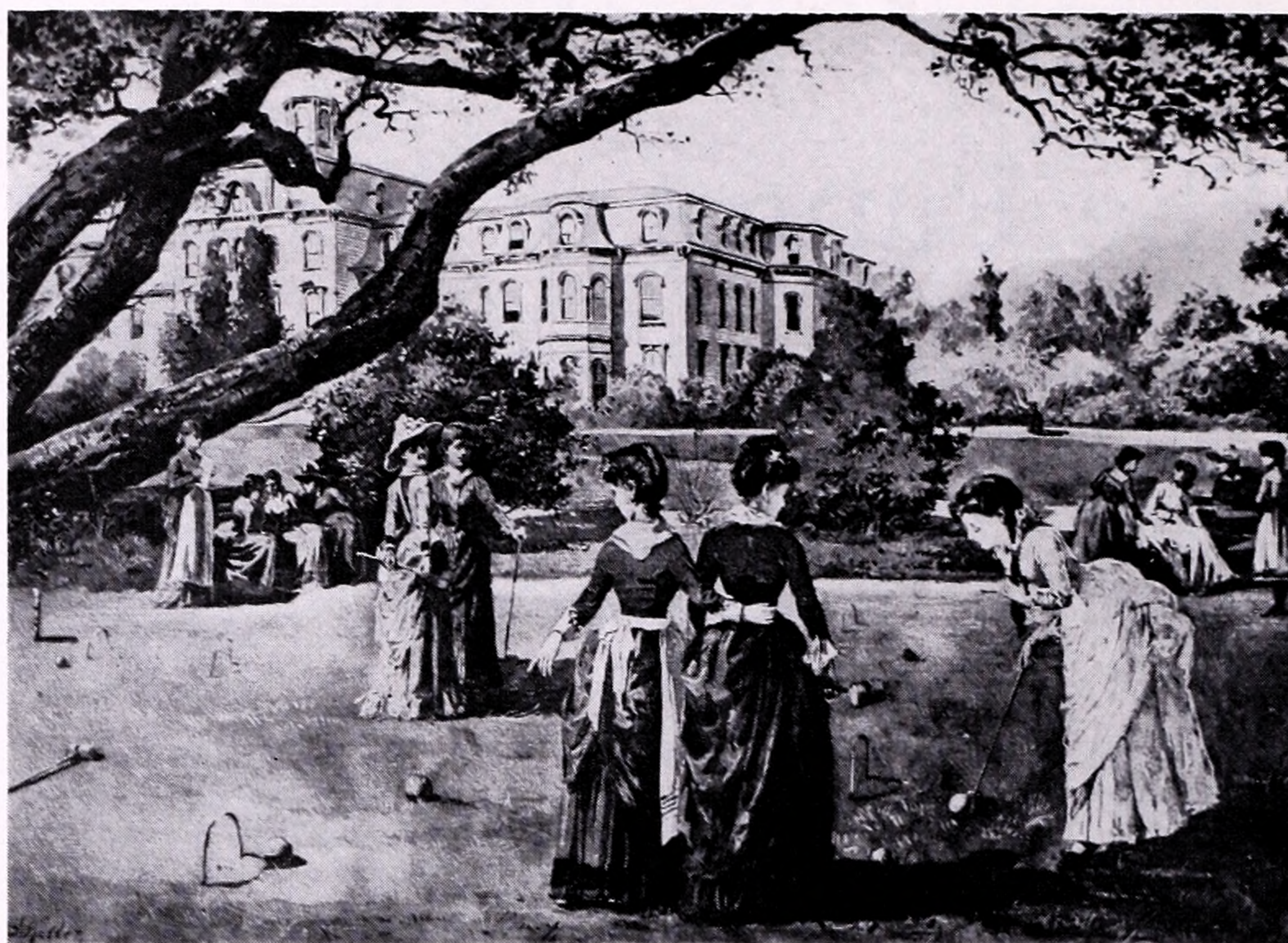
A sedate game of croquet at Mills Seminary in the 1880's

In the nineteenth century when American women began to want to go to college, the established institutions of the Northeast were so blissfully male that they could not muster enough Christian charity to admit women. So women's colleges had to be founded, faute de mieux .