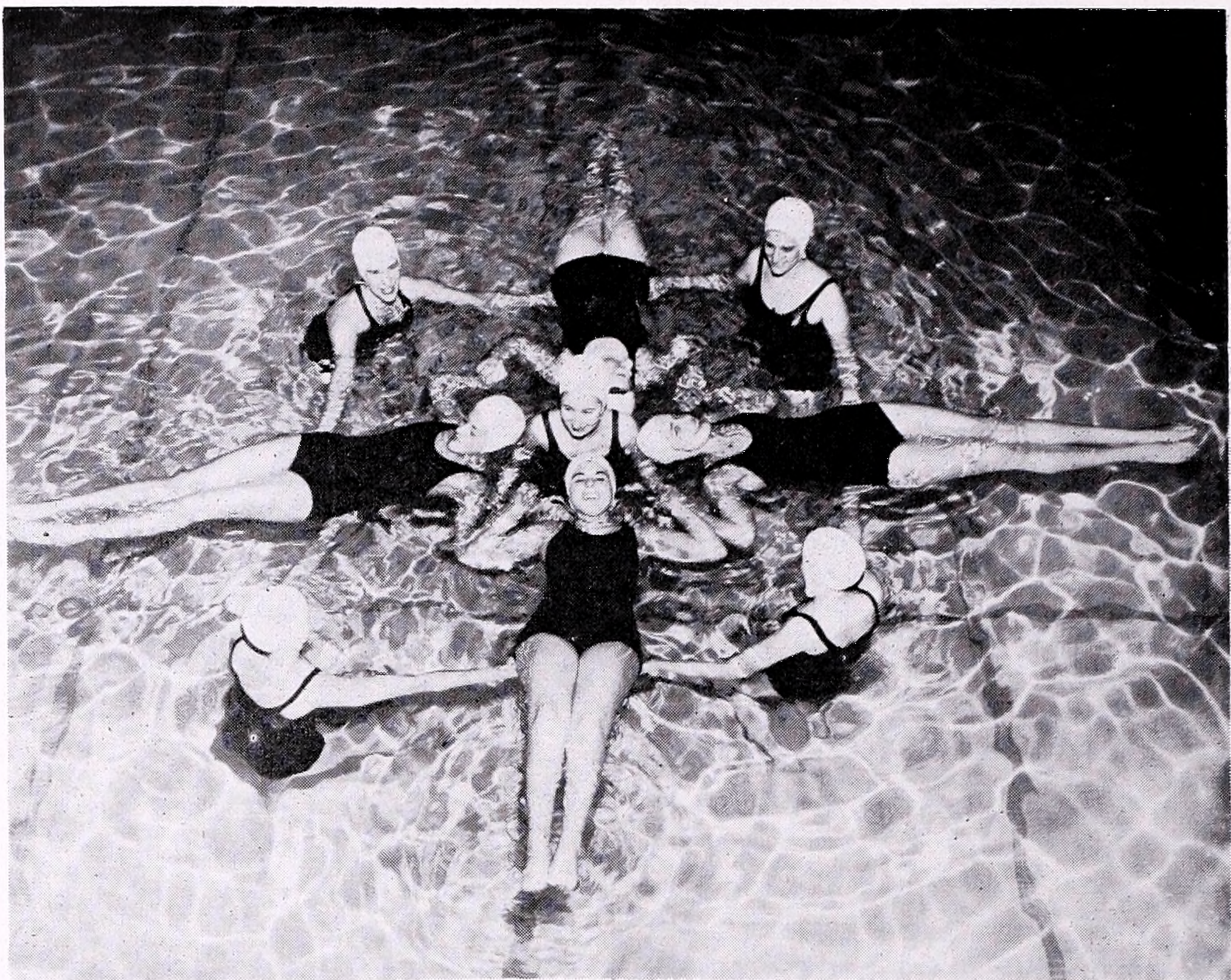
Barnardites forget about Old Man Winter at annual Water Ballet

It would be impossible to achieve any of our aims without being progressive and experimental. There is so much challenge in each day's work in a good nursery school, in each parent meeting or individual conference, in each staff meeting, in each visit to another school that we still regard it as a pioneering field. Parents who often make a considerable personal effort to send their children to nursery school foster this feeling and do much of the missionary work. Those of us who are in the field feel that we are making a contribution in the area of human relations and hope that it can be magnified many times in the future.