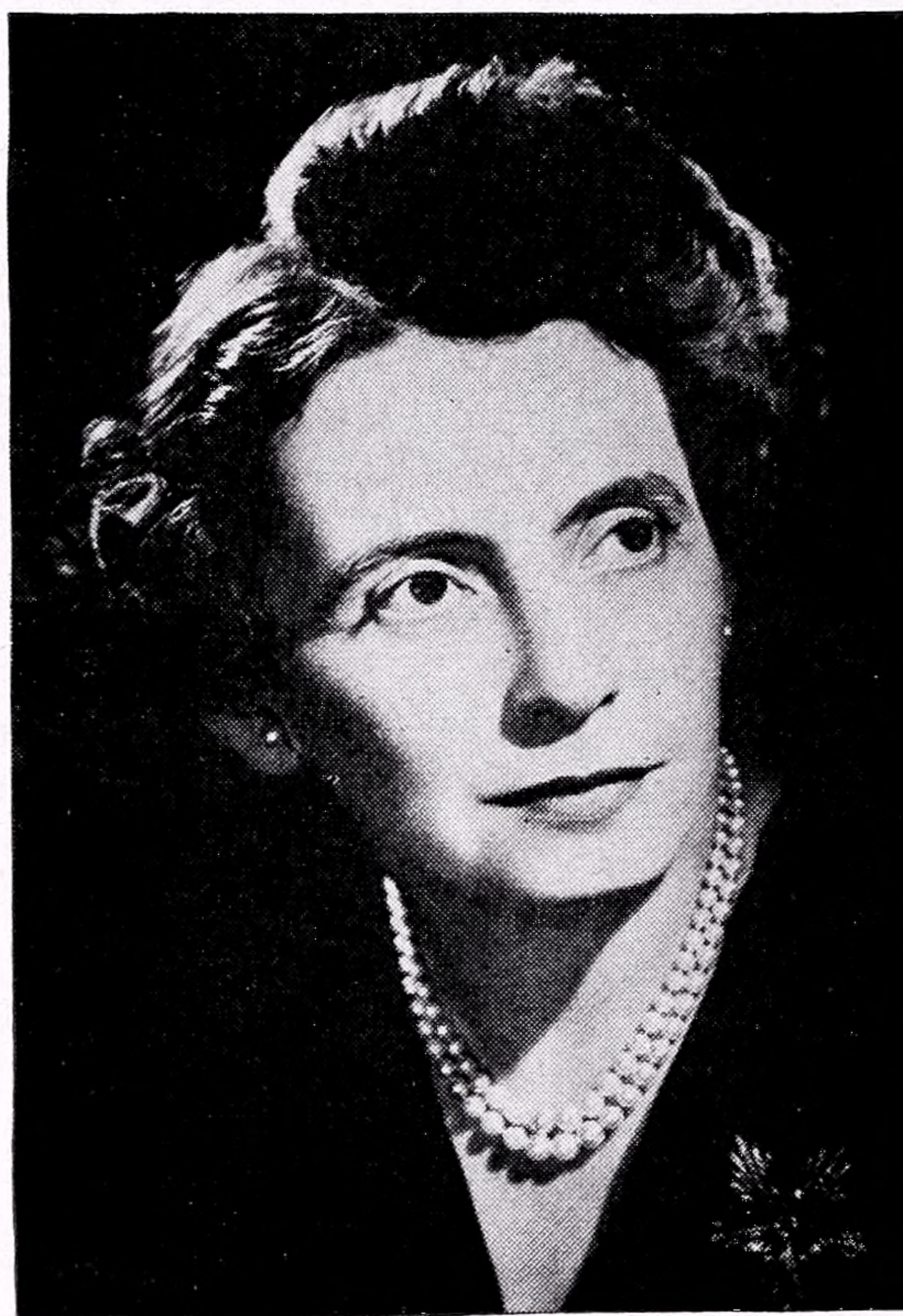
Anna M. Rosenberg, Assistant Secretary of Defense, who will make the main address at the Barnard Forum on Saturday, February 17 in the Waldorf Astoria.

8:30 P.M. Junior Show, "Handle With Care." Tickets, at $1.20 each, may be purchased at the door or through the Student Affairs Office, Barnard Hall.—Brinckerhoff Theater.