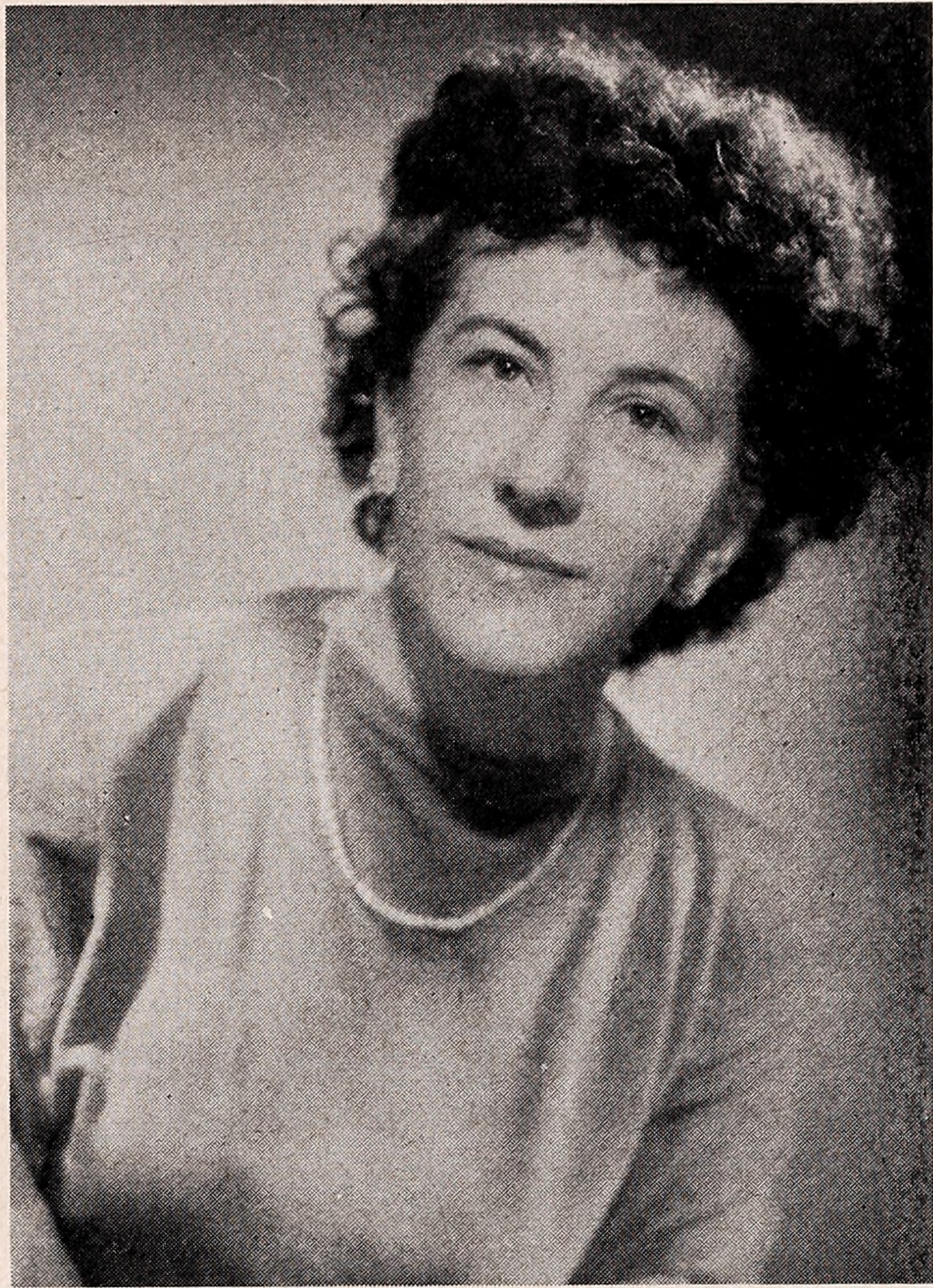
DIRECTOR OF THE OCCUPATION BUREAU

What to do, once back in the U.S., that might possibly help towards international understanding—was the question that many of us asked. The immediate answer for me was working on the foreign student program of the American Friends Service Committee. The philosophy of the Friends