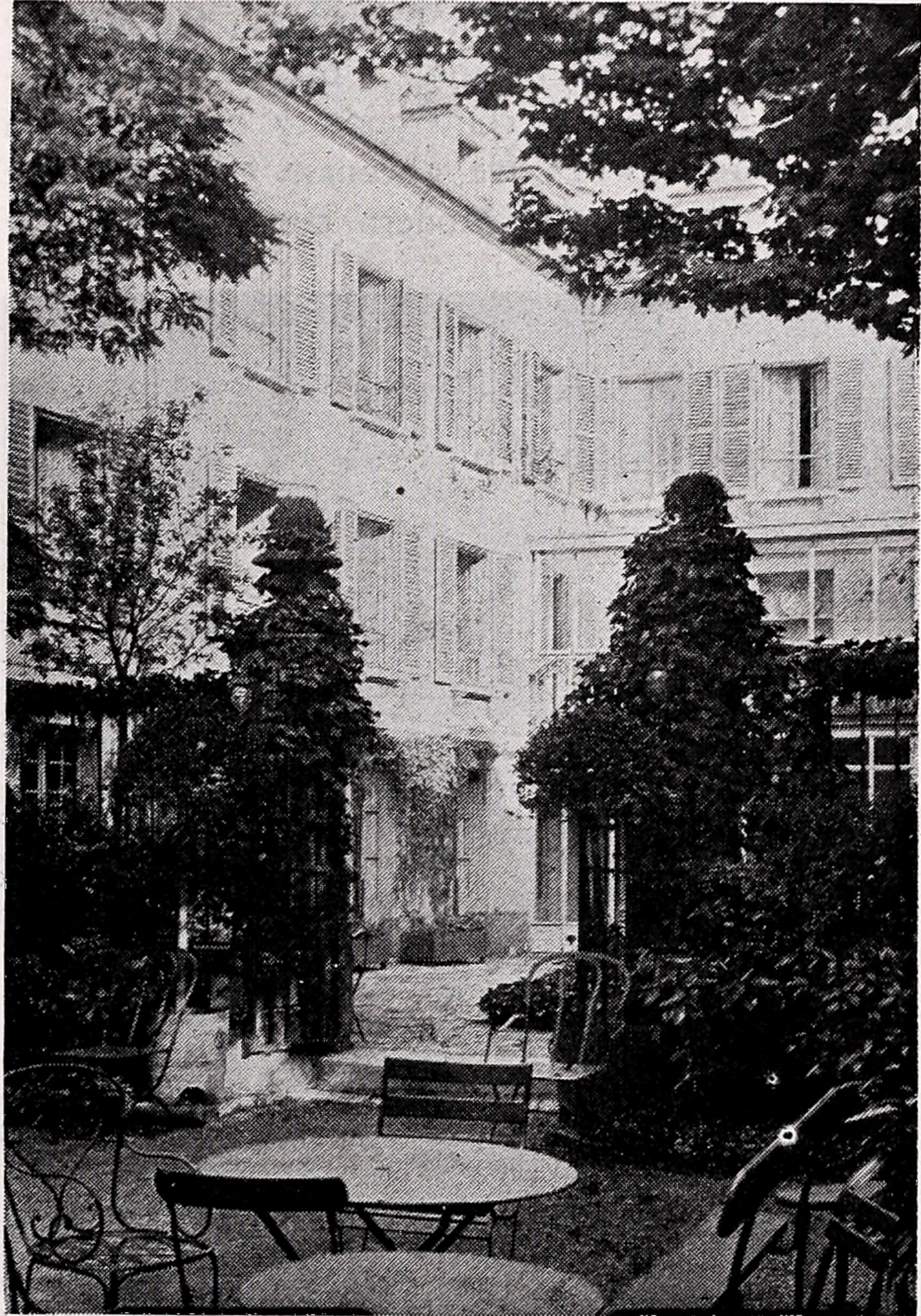
Reid Hall—a corner of the courtyard.

The main lines of the political events during these active months are well-known to us, but it