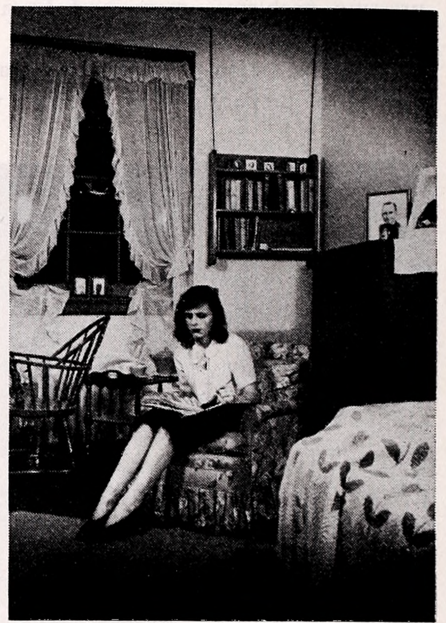
This one studied at home.

The Barnard Bulletin plunged editorially to the very root of the problem. "What," it asked, "are the basic educational aims of Barnard?" The old plea for a "reexamination of the curriculum," always the undergraduate panacea for all their woes, was presented again in the face of this menace. "If the new exams are to be instituted,