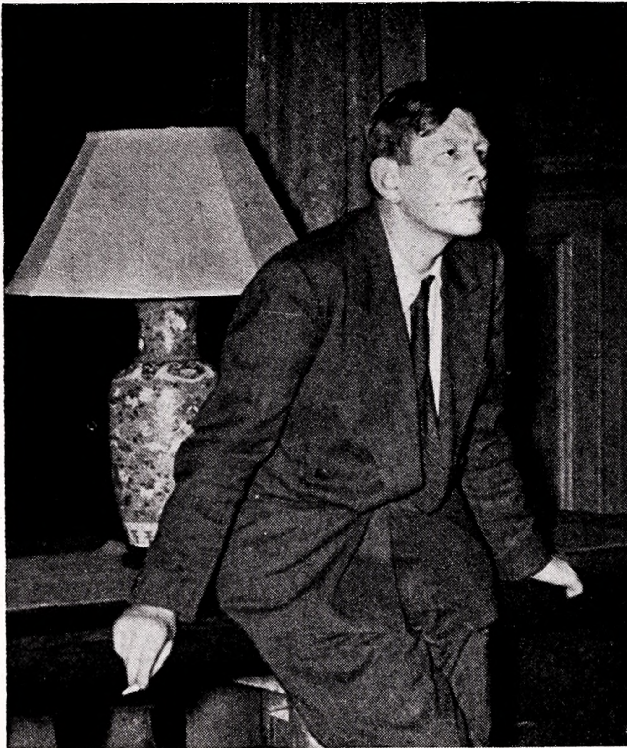
W. H. Auden addresses a meeting in Brooks Hall

NEW NAMES WILL BE PASTED on the Faculty mail boxes at the beginning of the second semester. The noted contemporary poet Wystan Hugh Auden will give a course entitled "The Quest in Ancient and Modern Literature" during