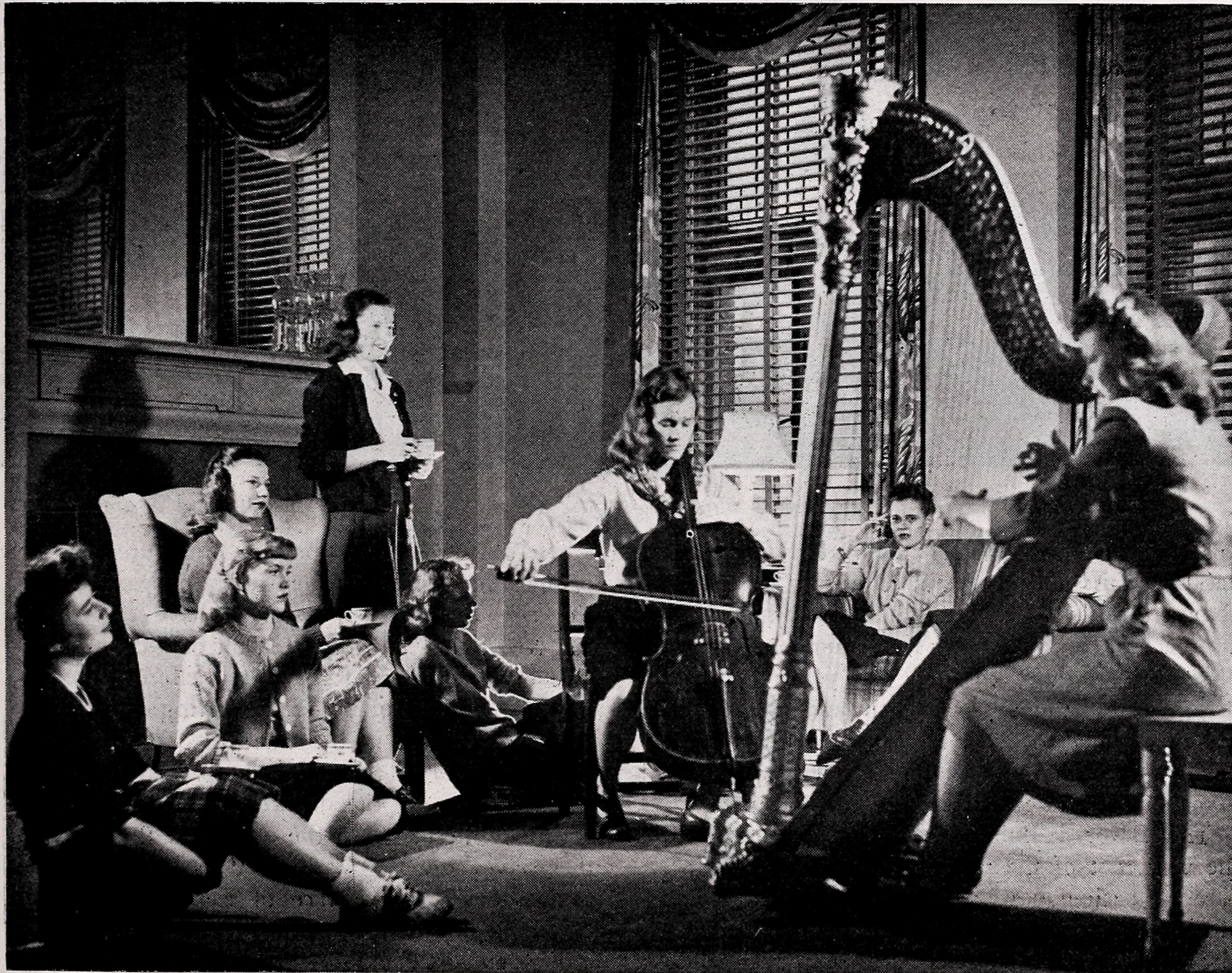
Listening Hours are the contribution of music majors to evening recreation.

The Committee on Instruction went to work on ways and means. A meeting of the Faculty on January 6, 1947 heard and discussed its report, and leaving "to the departments the widest possible latitude in the preparation and administration of the major examinations," adopted definite