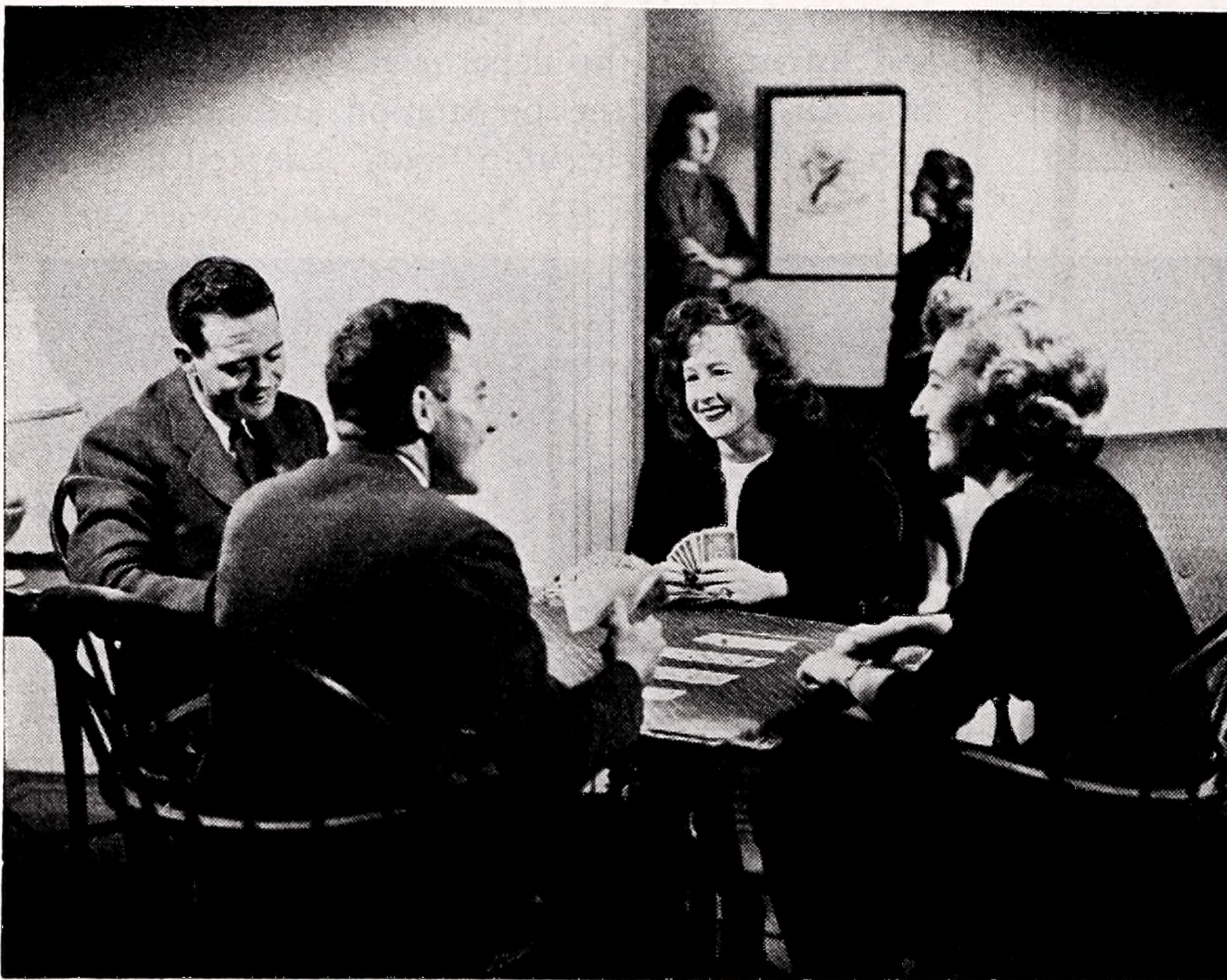
These little students played bridge with the boys

That last question we can answer. Since 1931,