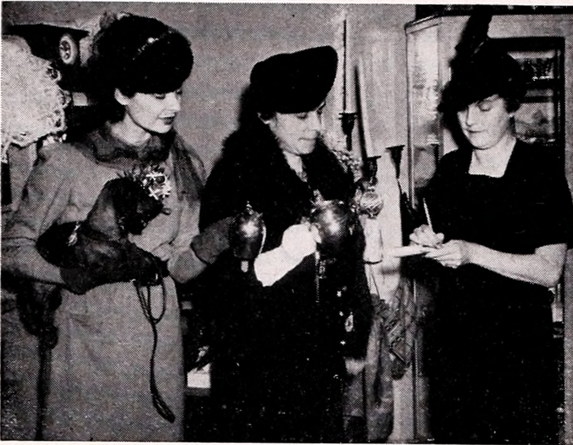
Opening of Thrift Shop—1937