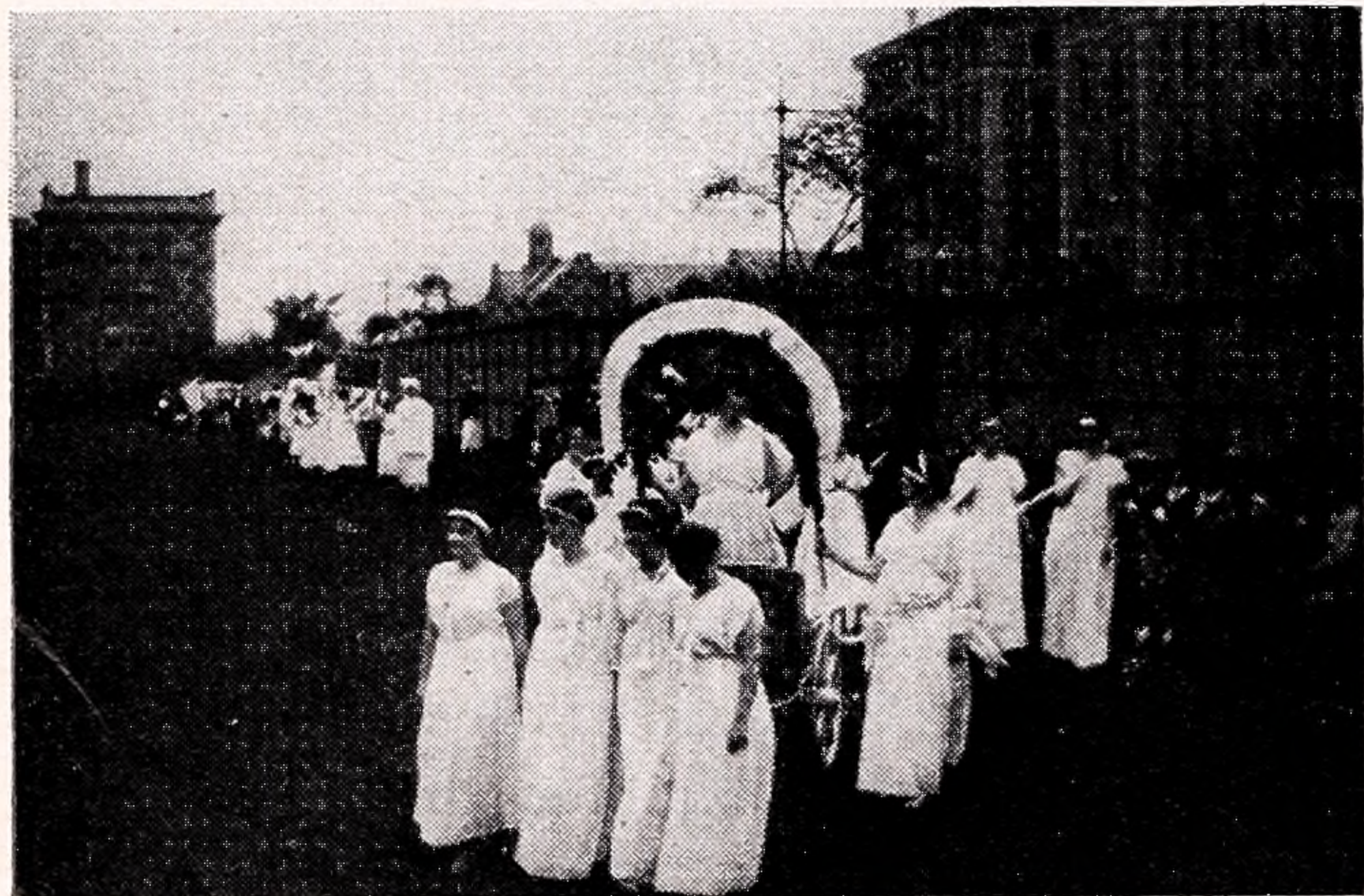
Alumnae Day Parade—1915