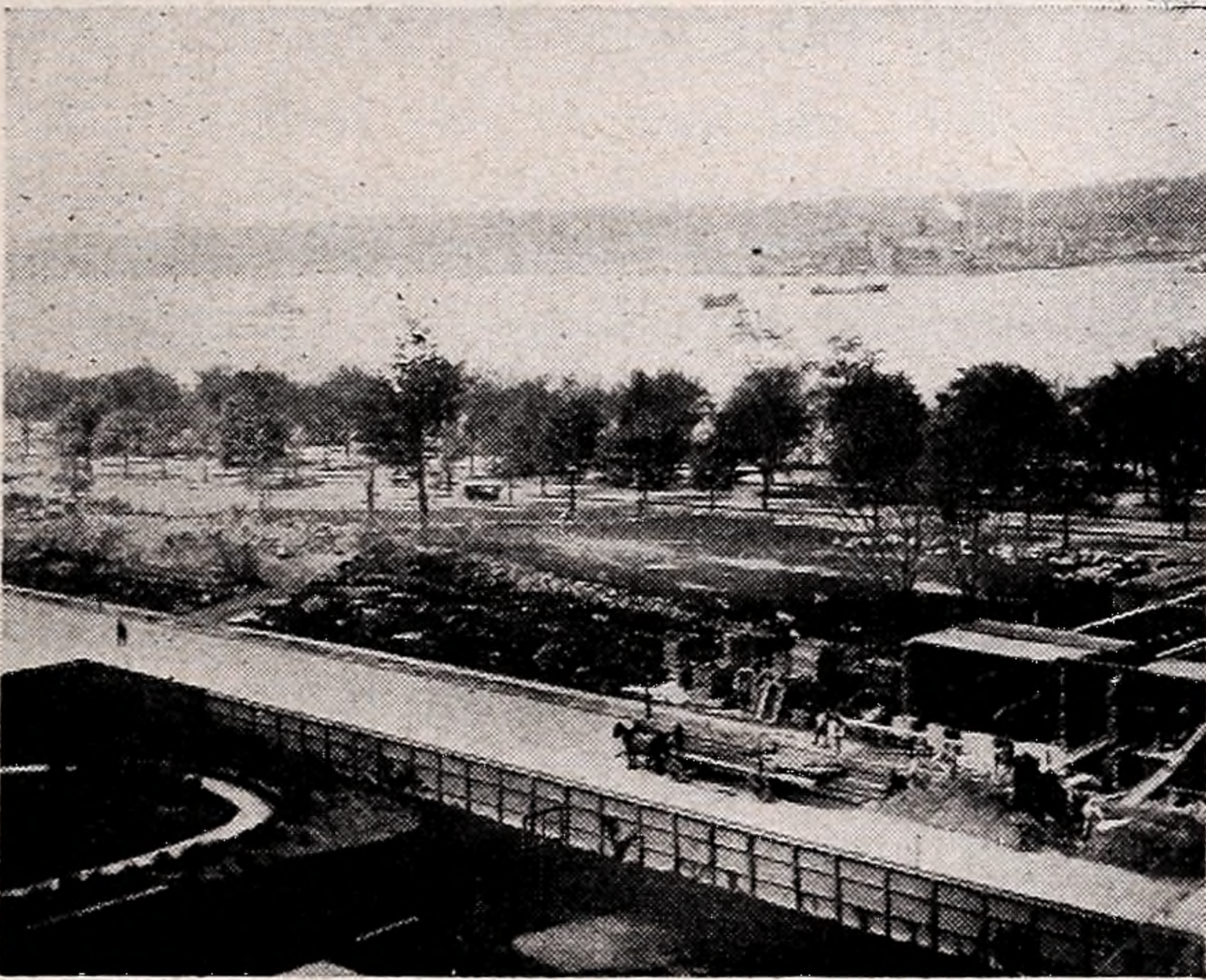
From Brinckerhoff roof to the Hudson—1907

The association had two main objectives. One was to keep in touch with the College and each other the graduates that had received the opportunities afforded by Barnard—opportunities that