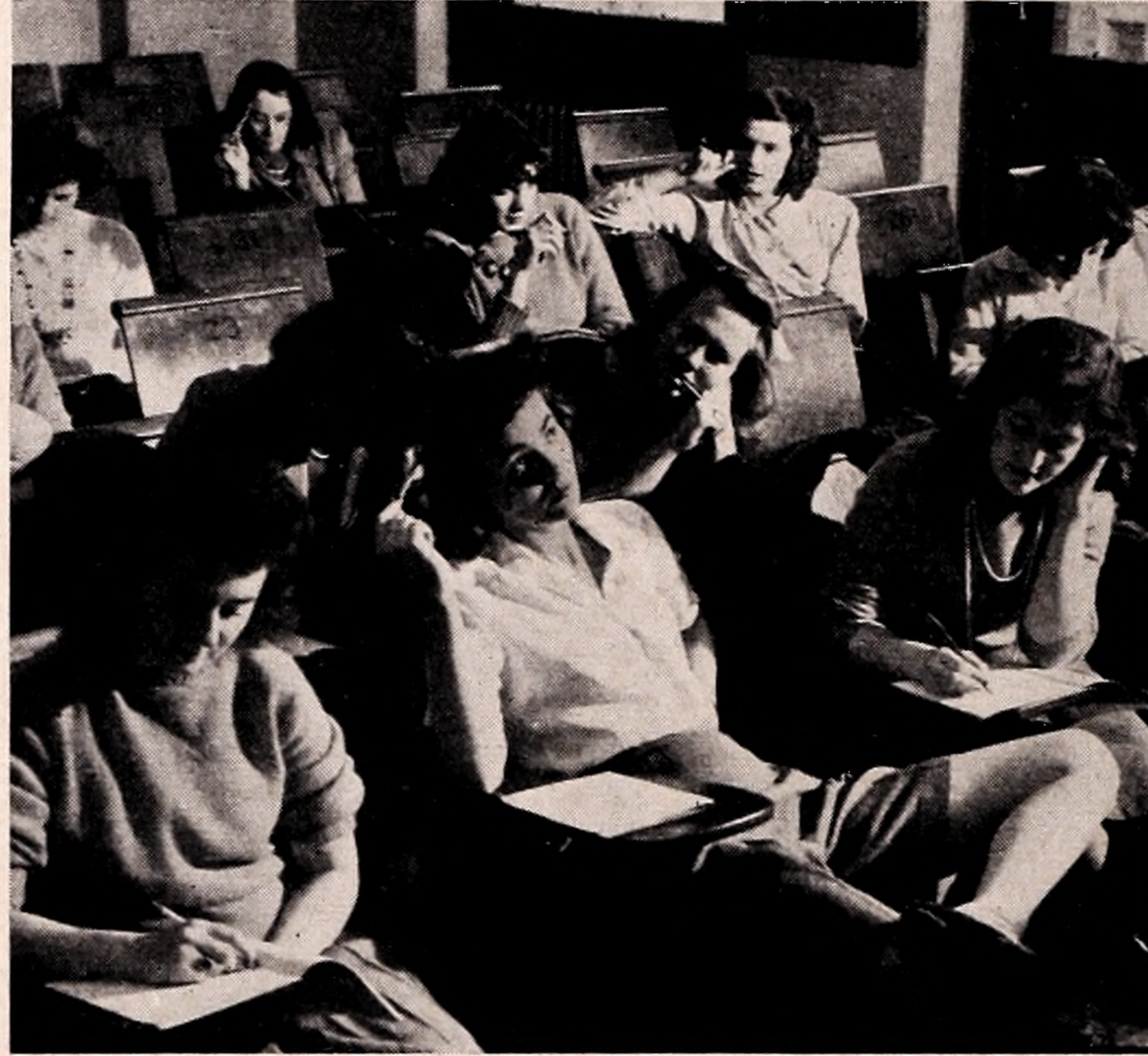
Mortarboard exams.. the final degradation

Acceleration at Barnard was introduced for the purpose of turning out 'trained brains' more quickly for the war effort. The 34 students who participated in the college's first formal mid-year graduation in history are planning to meet this responsibility. Aside from four who will do graduate work in international relations, medicine,