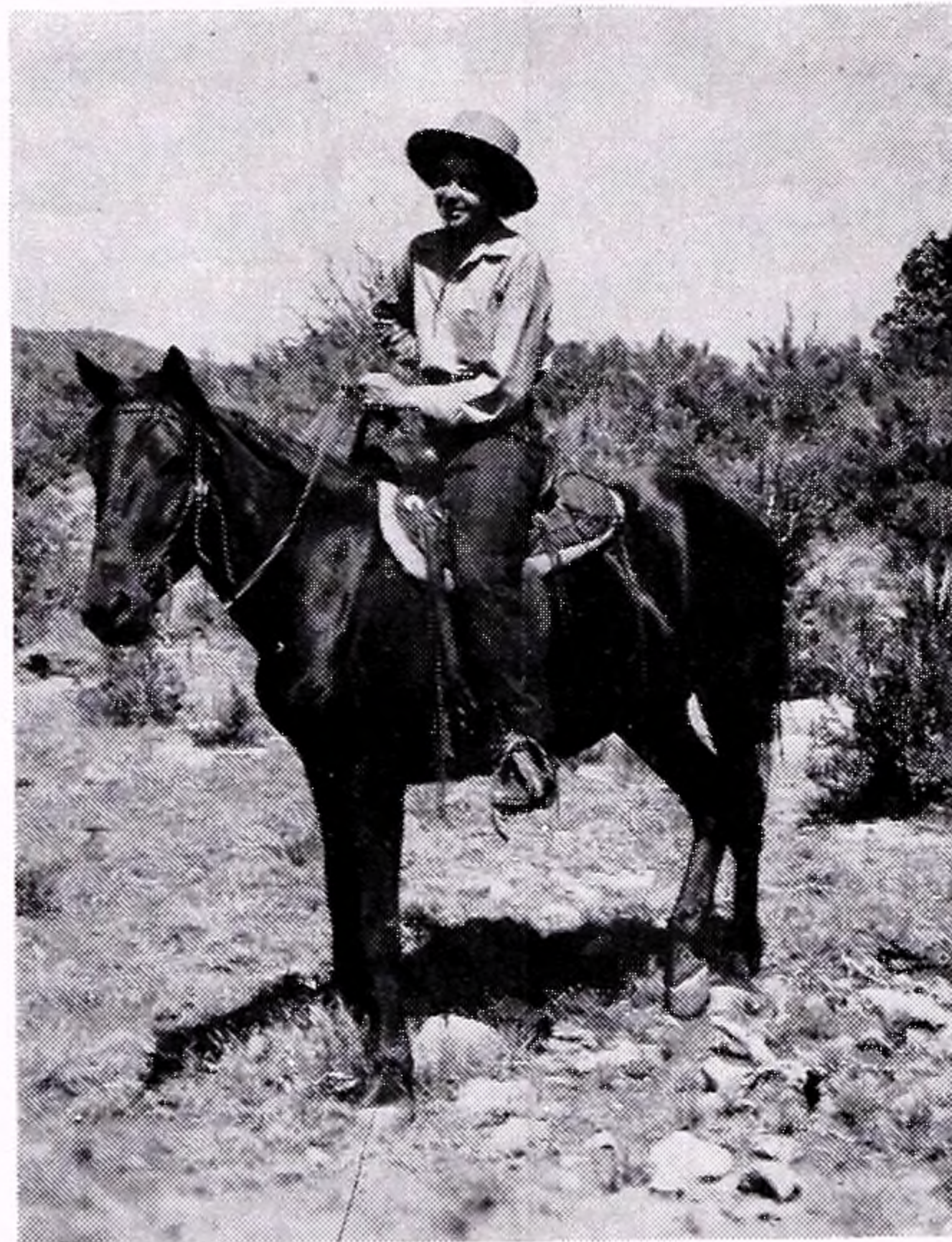
Quite at "Home on the Range"

Our summer home is the main ranch since it is during these months that we have the cattle. It is built of logs, or rather they are, as we have two buildings, one for the living room, dining room and kitchen and the other for bedrooms and bath. Contrary to many opinions, Arizona is not all desert for our ranch is in one of the most extensive pine forests of its kind in the United States and the logs and woodwork of the houses are all native lumber. They are comfortably furnished with an eye to easy