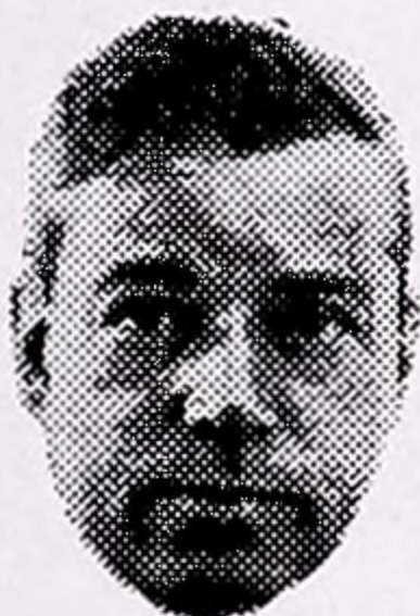
George Jean Nathan on The Theatre