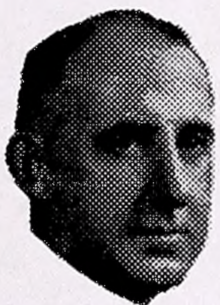
Raymond Moley on Politics and Government

Stimulating, Thought-Provoking, these Famous Commentators Lend New Interest to the News!