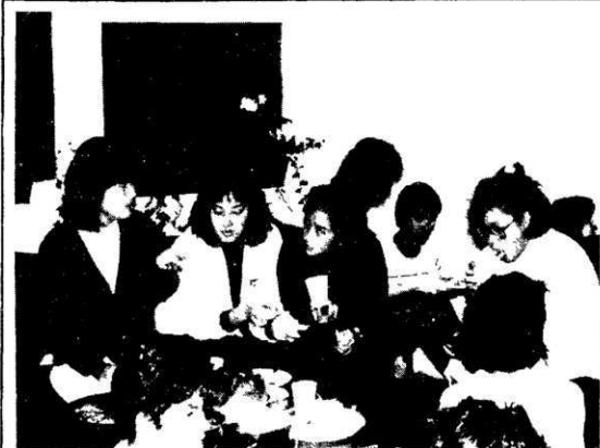
Residents of the 600's turned out for the Progressive Dinner last Sunday, November 17. Hors d'oeuvres were prepared and served in 620, entrees in 616, and desserts in 600. The dinner was sponsored by Project Freshstart.