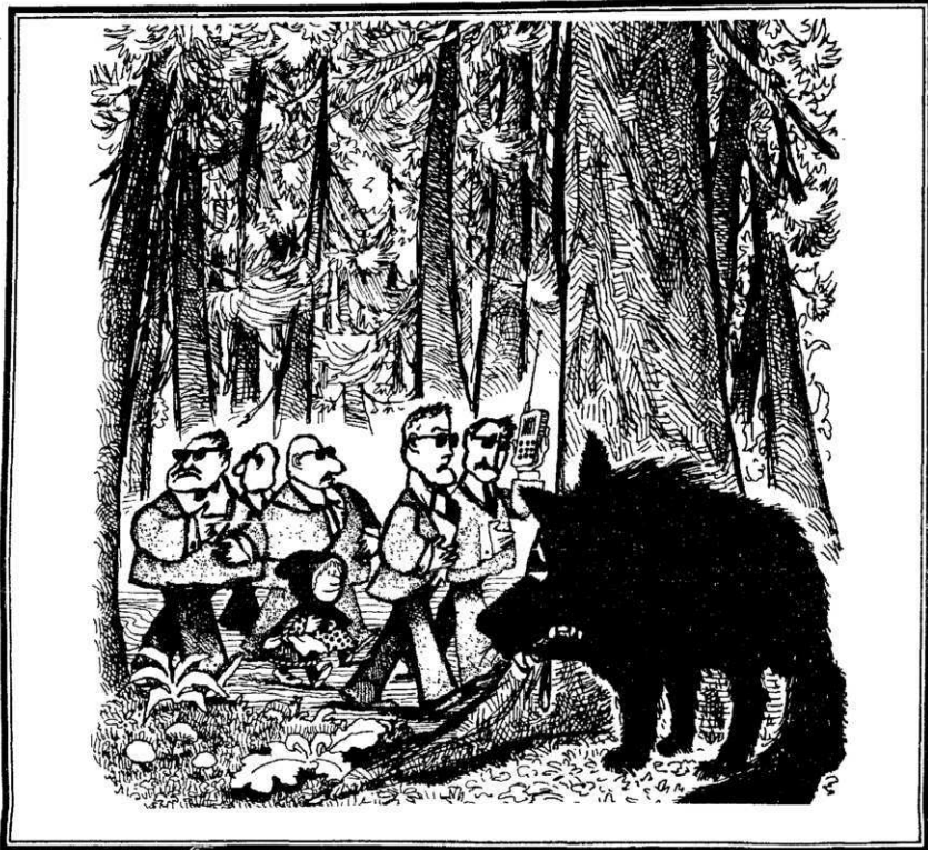
The KGB escorts Little Red Commihood past the Big Black Wolf of U.S. Imperialism.

More frequently than not, Quino illustrates the darker side of human nature. As a government official prepares to board