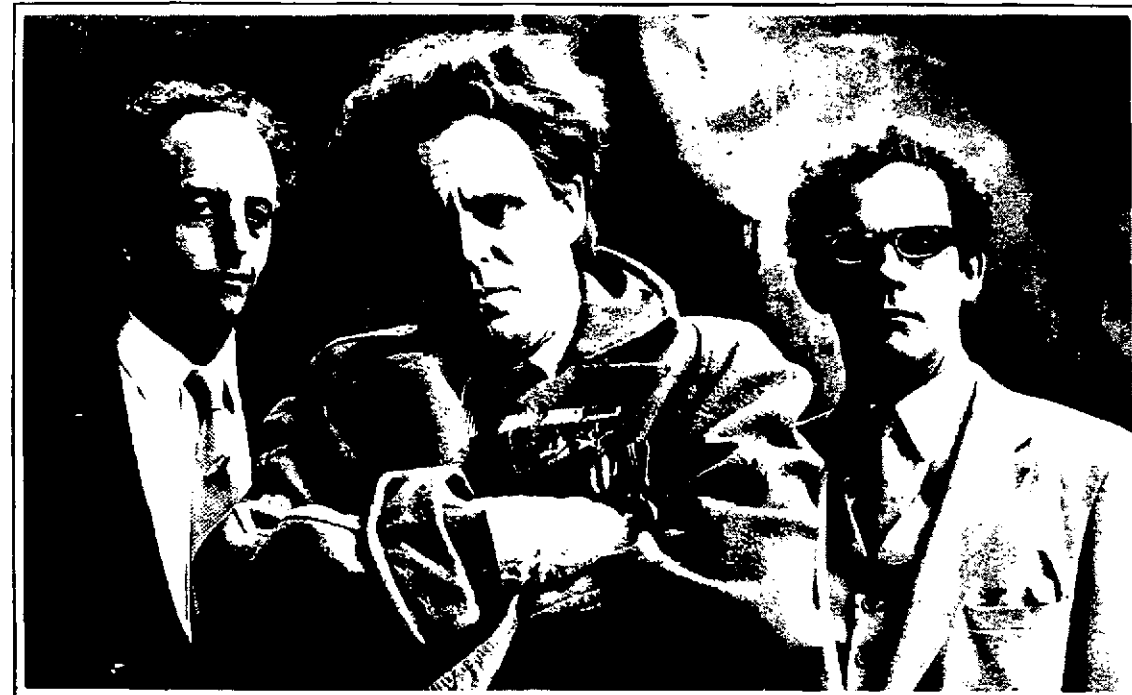
Dr. Emilio Lizardo (John Lithgow, center) and his sordid lieutenants