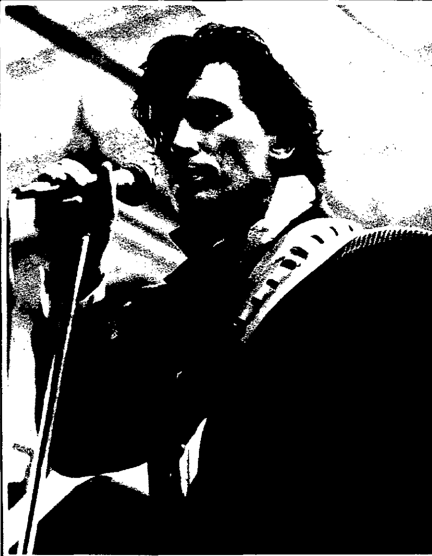
Peter Weller as Buckaroo Banzai