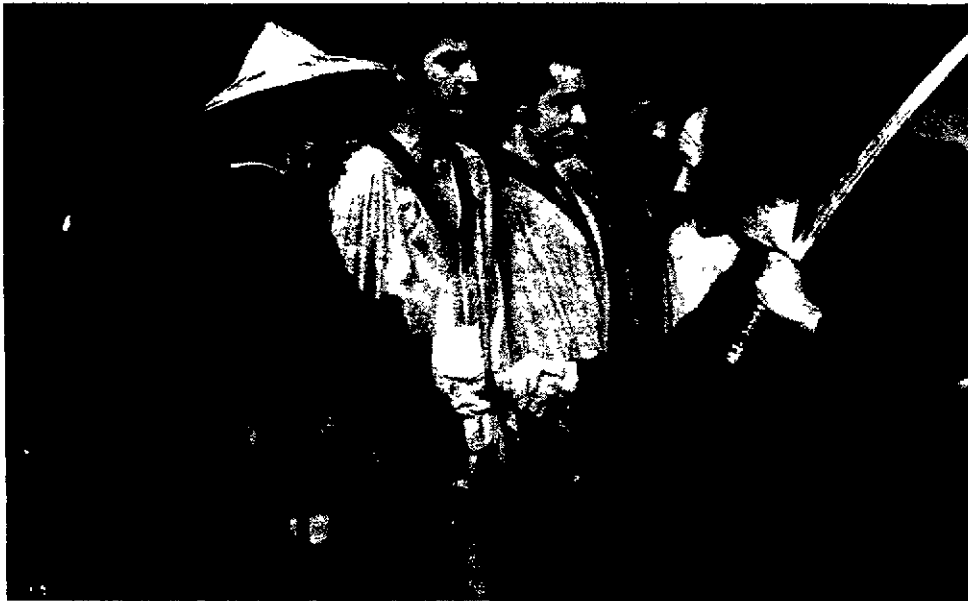
'The Mikado' begins its second run tonight in in the Theater of Riverside Church.