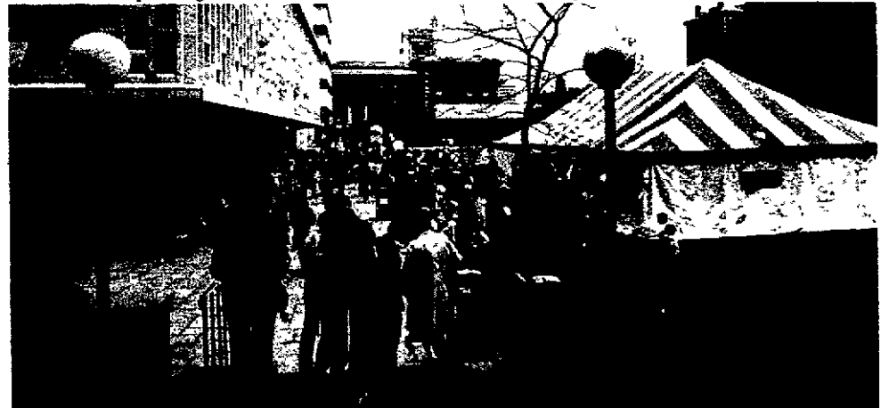
This year's Spring Festival will include many of the features of last year's Festival, which was held under a tent on Lehman lawn.

Anyone desiring additional information about the Spring Festival should contact the College Activities Office at x2095, or any of the above chairwomen.