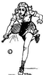
Barnardian skill playing tennis

The numbers may be slightly misleading however. Out of a random sampling of optional Phys Ed takers a little less than half reported that they never attended their classes. I signed up for gym in the beginning of the year," one student told Bulletin, but I haven't gone yet. I don't know if they can flunk me and I don't really care. I don't know what I was