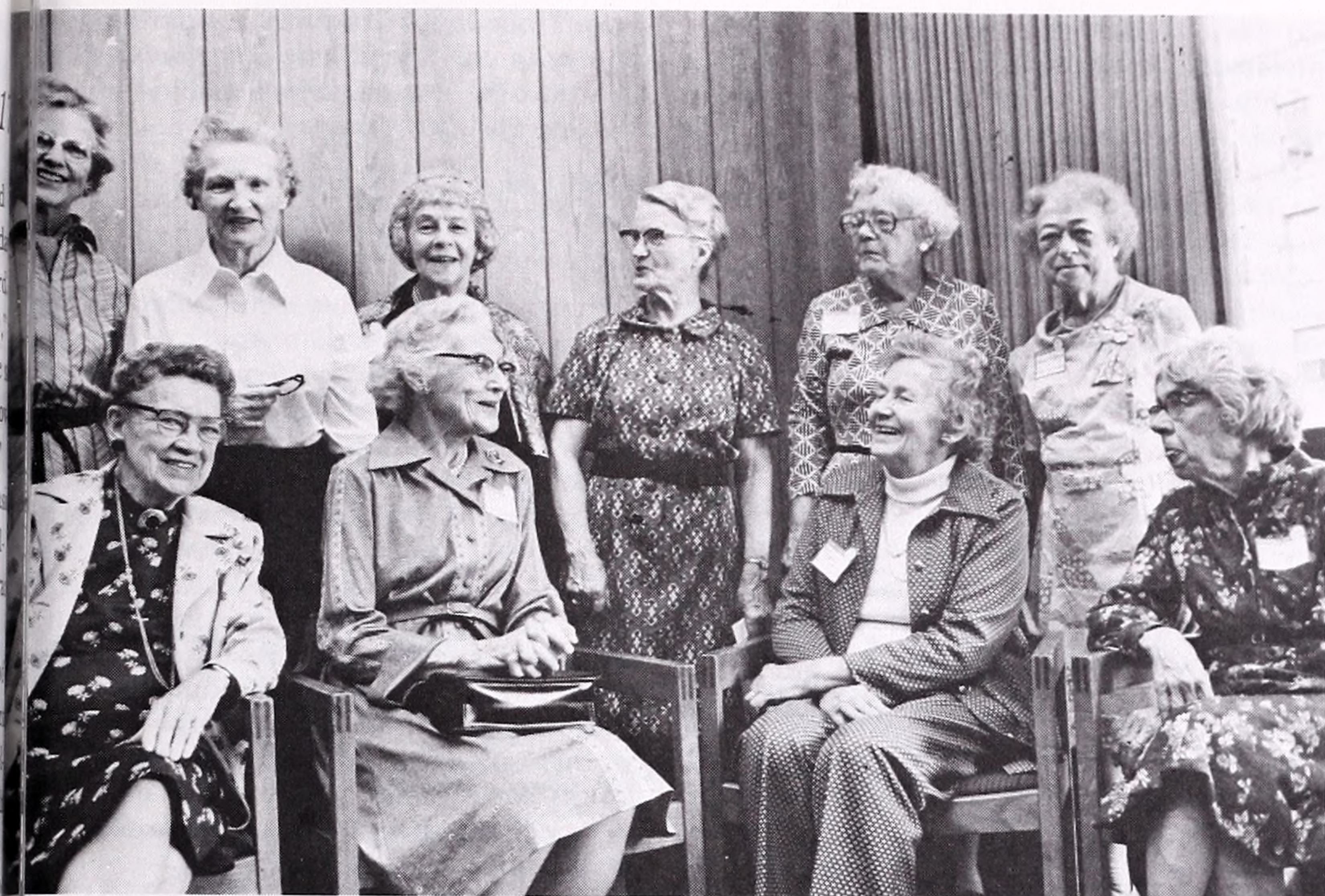
Class of 1920 enjoying their Sherry Reception before the Reunion Luncheon