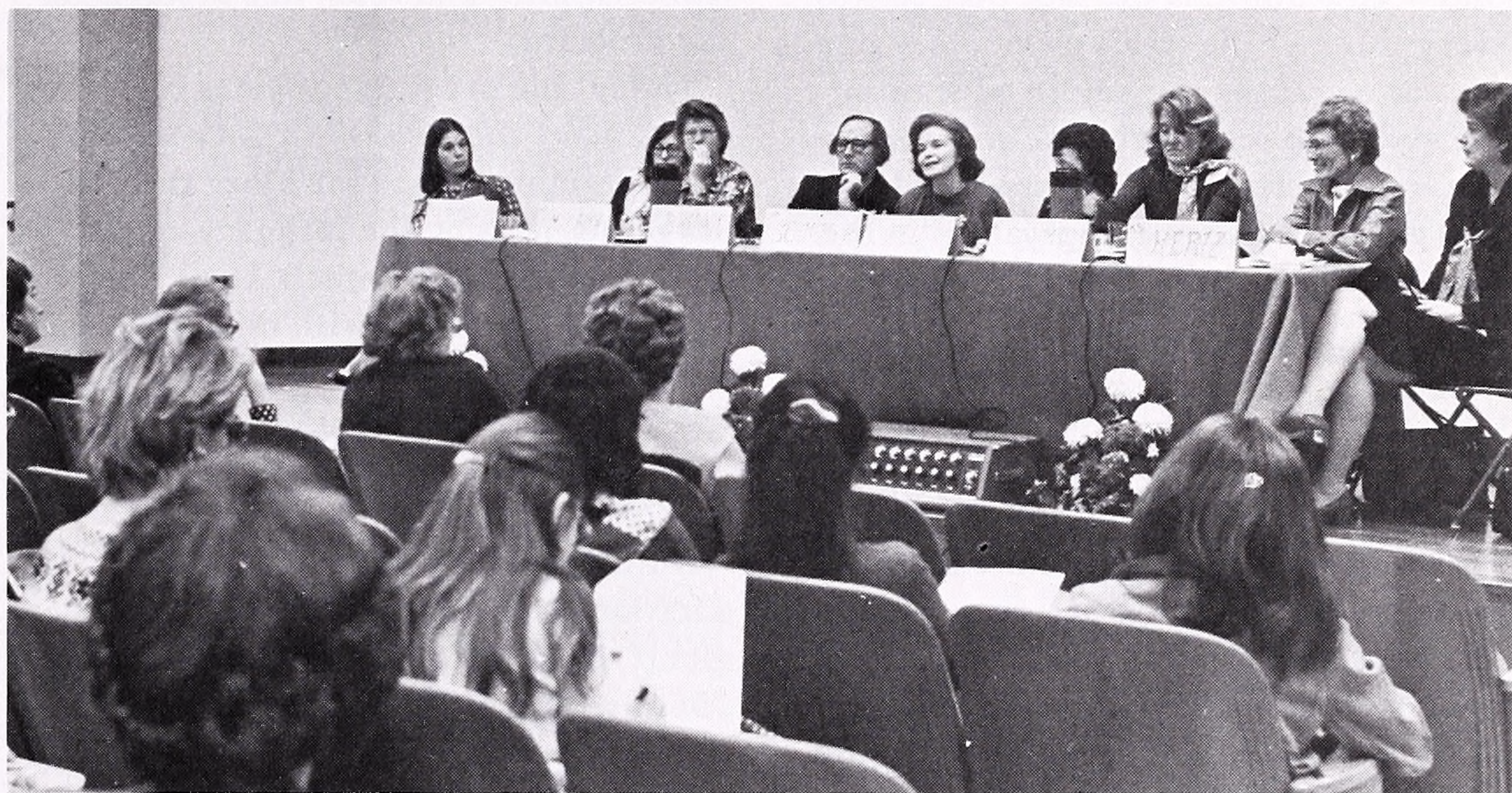
The "Ask the Experts" panel fielding alumnae questions