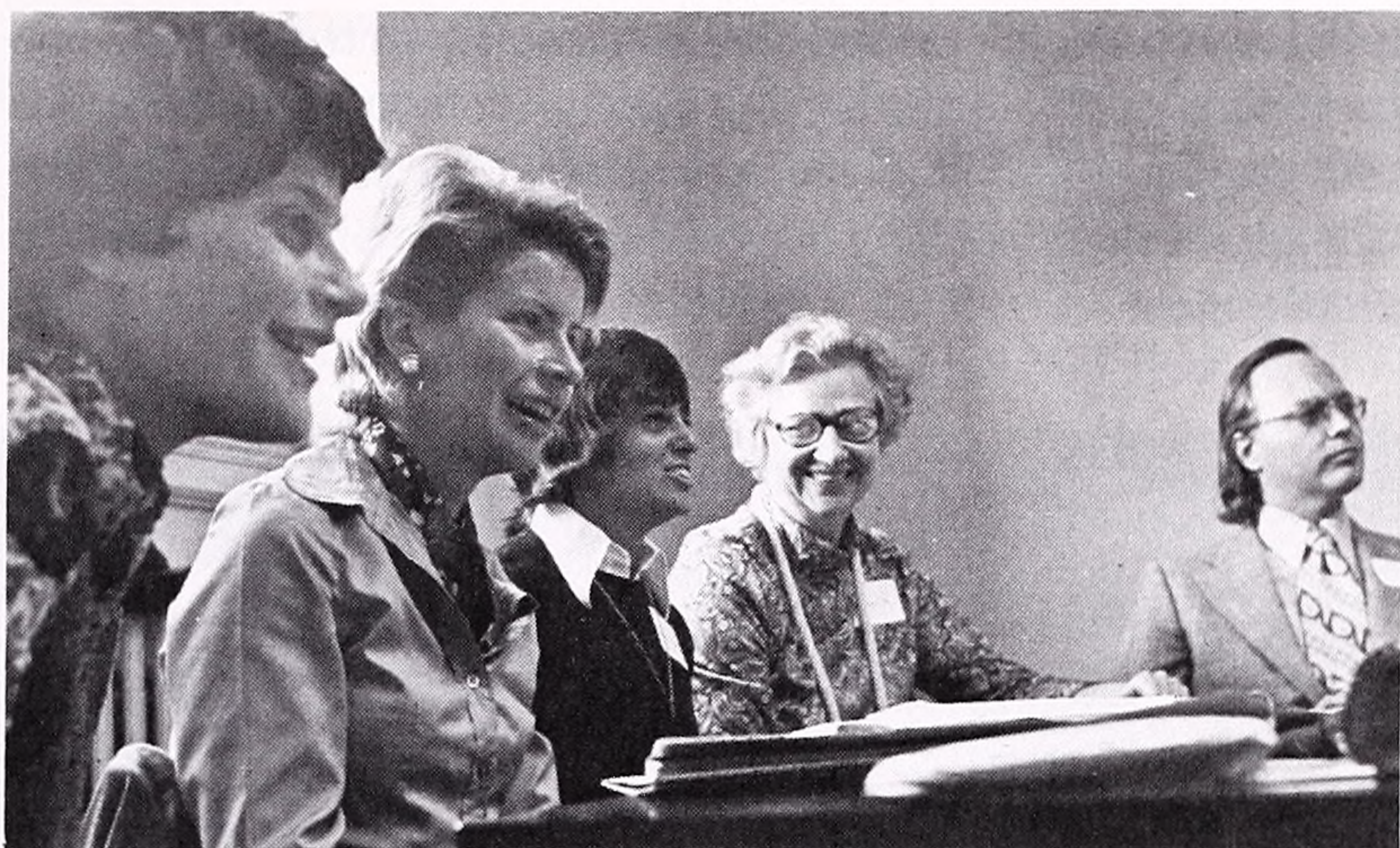
The speakers' panel listens at the Club Workshop

The final Council session on Saturday morning was