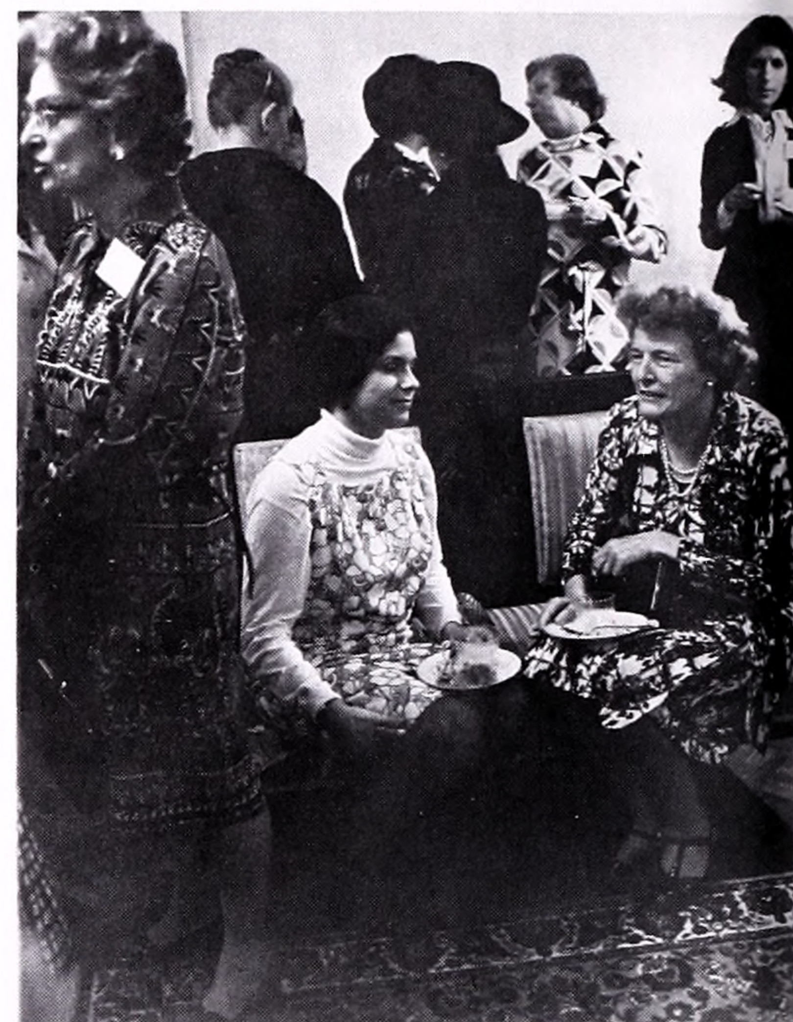
The opening reception last October introduced the new Townhouse clubrooms to a large and enthusiastic group