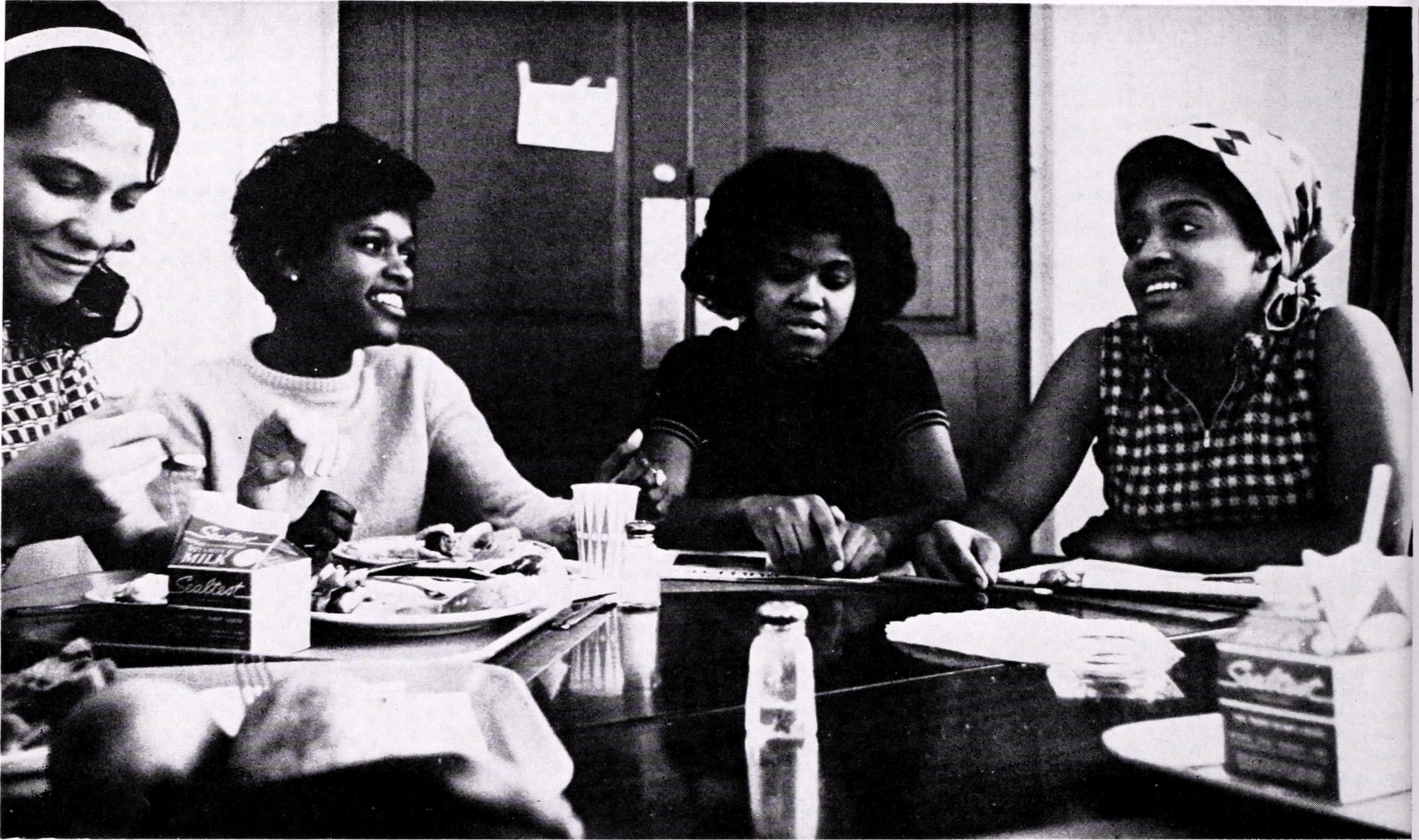
Black students at lunch at the "soul table" in the Hewitt Dining Room. They generally eat together at this table, a large round one in the southwest corner of the dining room. Some people on the campus point gloomily to the table as an example of black separatism. Others point out that table cliques are traditional to college life, like the "football table" at a men's school, for example.