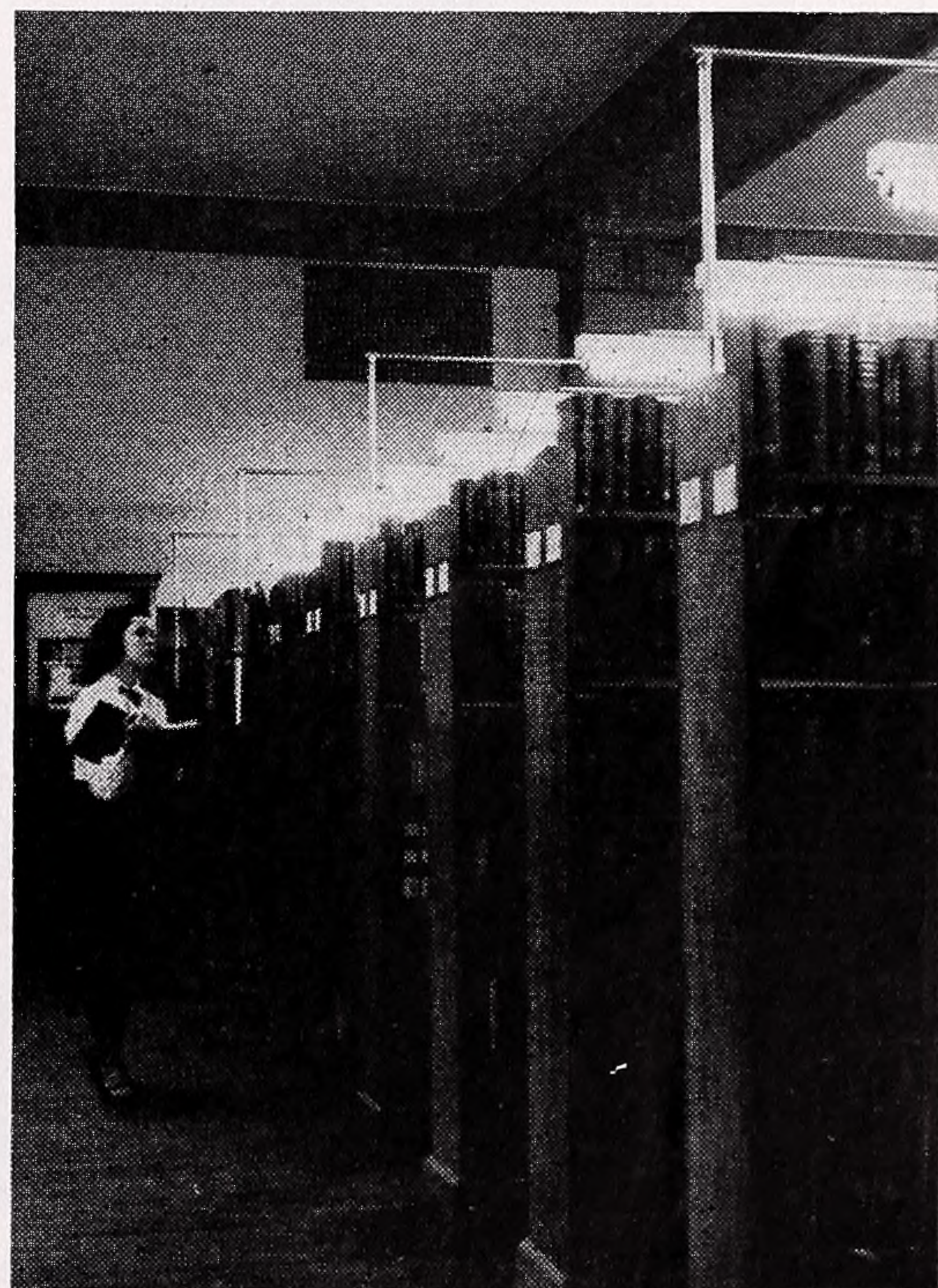
But it has engulfed two more rooms