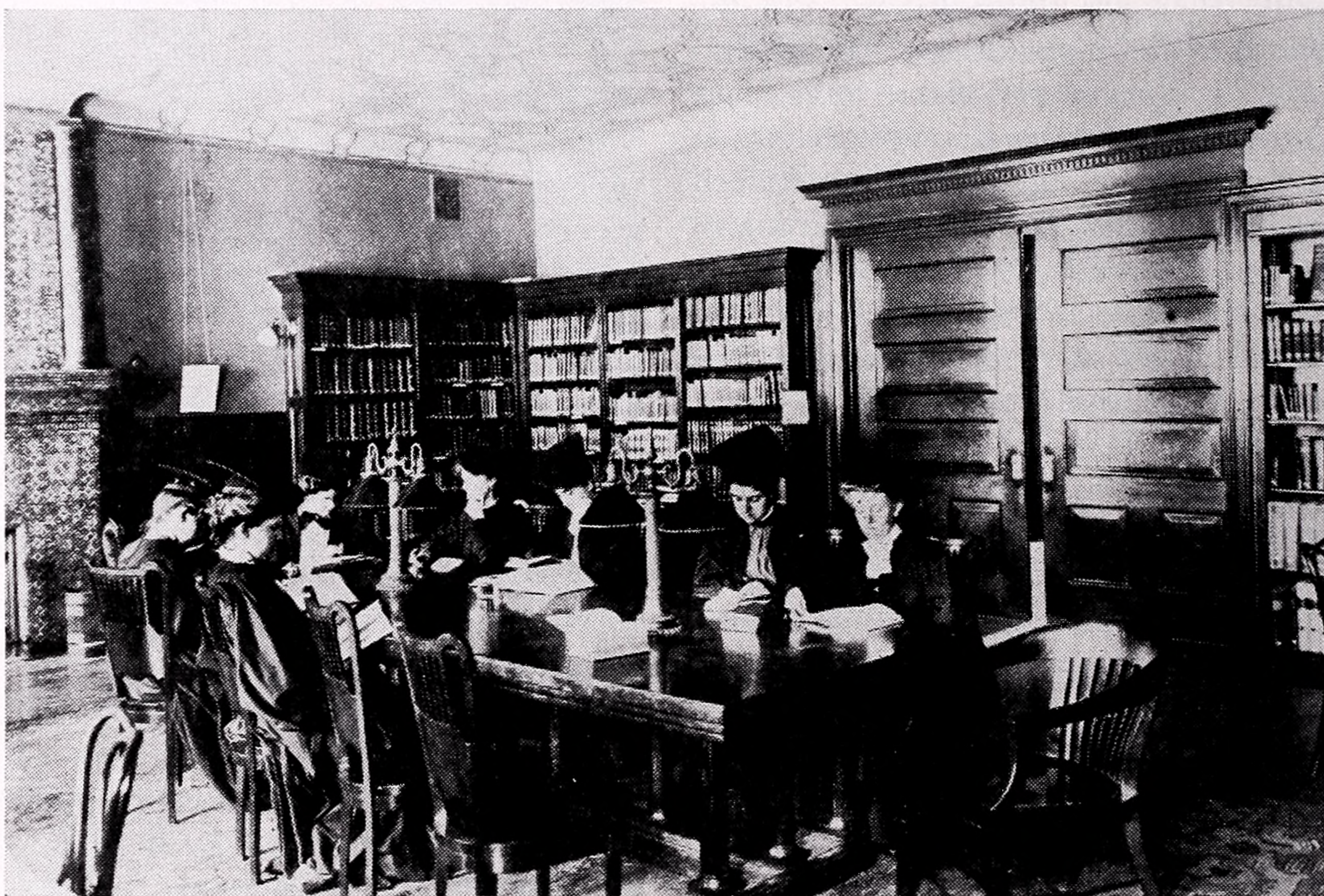
This was the Milbank reading room named for her as it looked about 1900