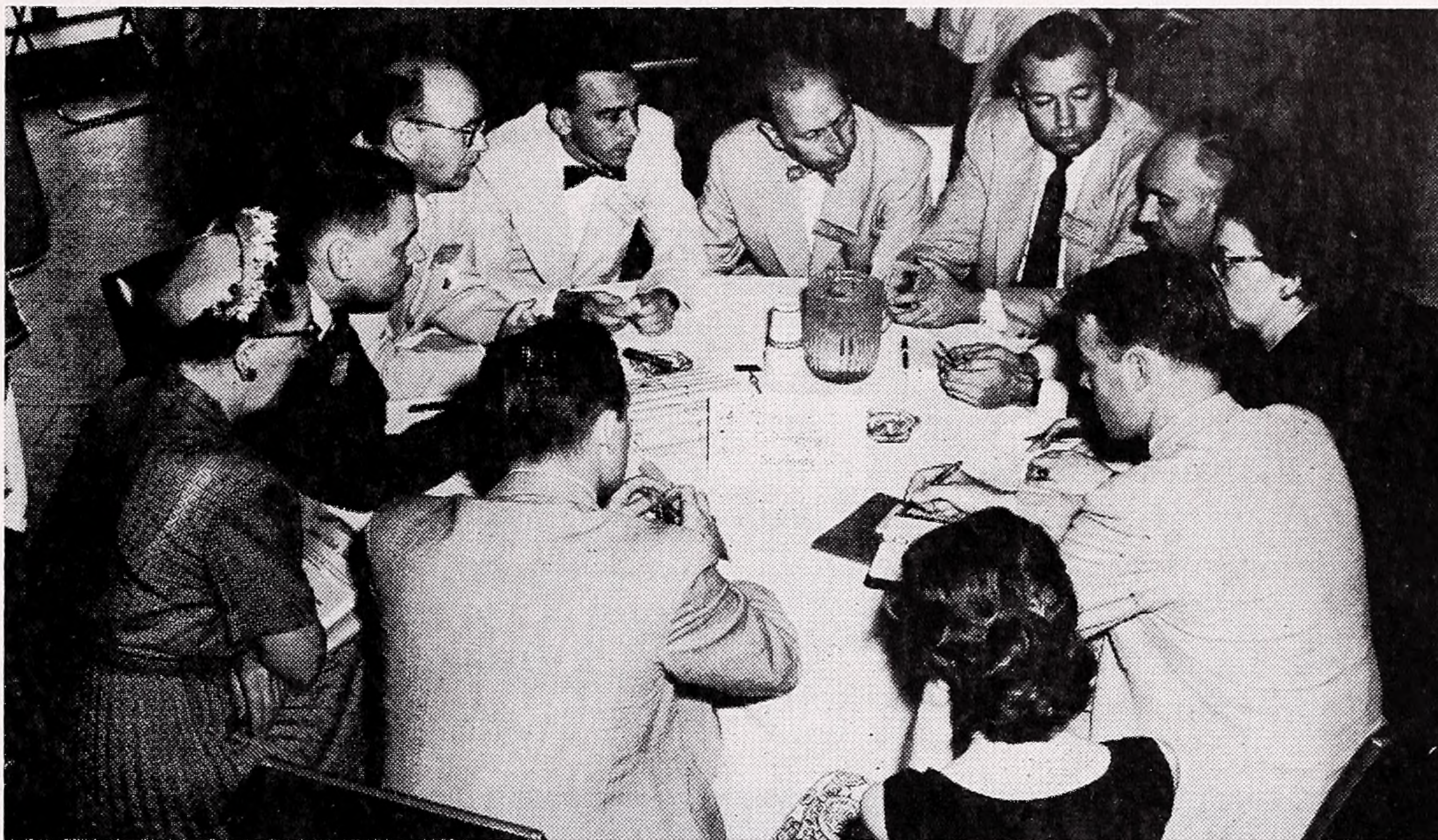
Members solve problems at informal round-table discussions

E DUCATIONAL organizations in this country, and there are hundreds of them, serve various functions. To explain what kind of an organization we are, it is helpful to state frankly