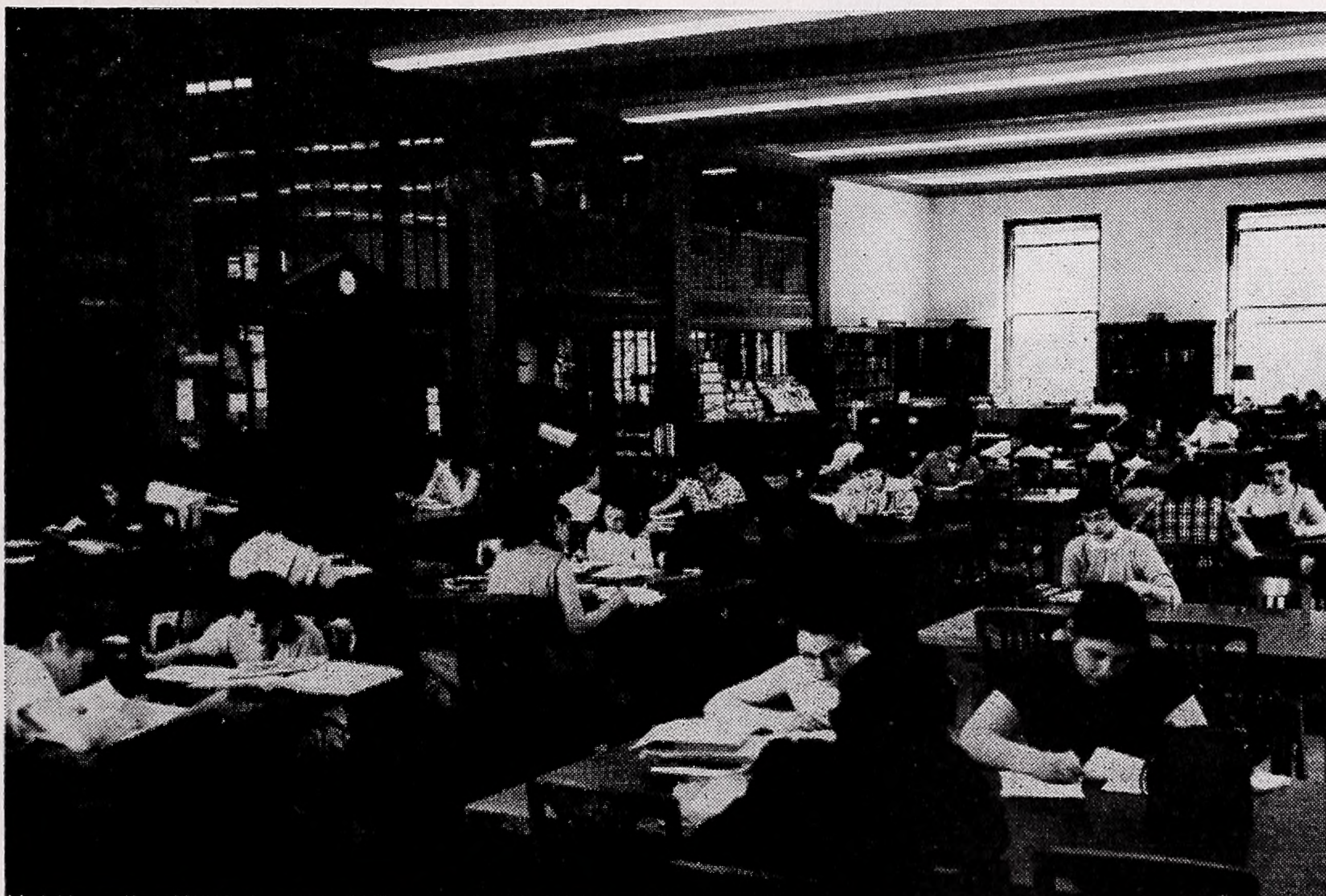
Moved to Barnard Hall in 1918, the library now appears only slightly changed