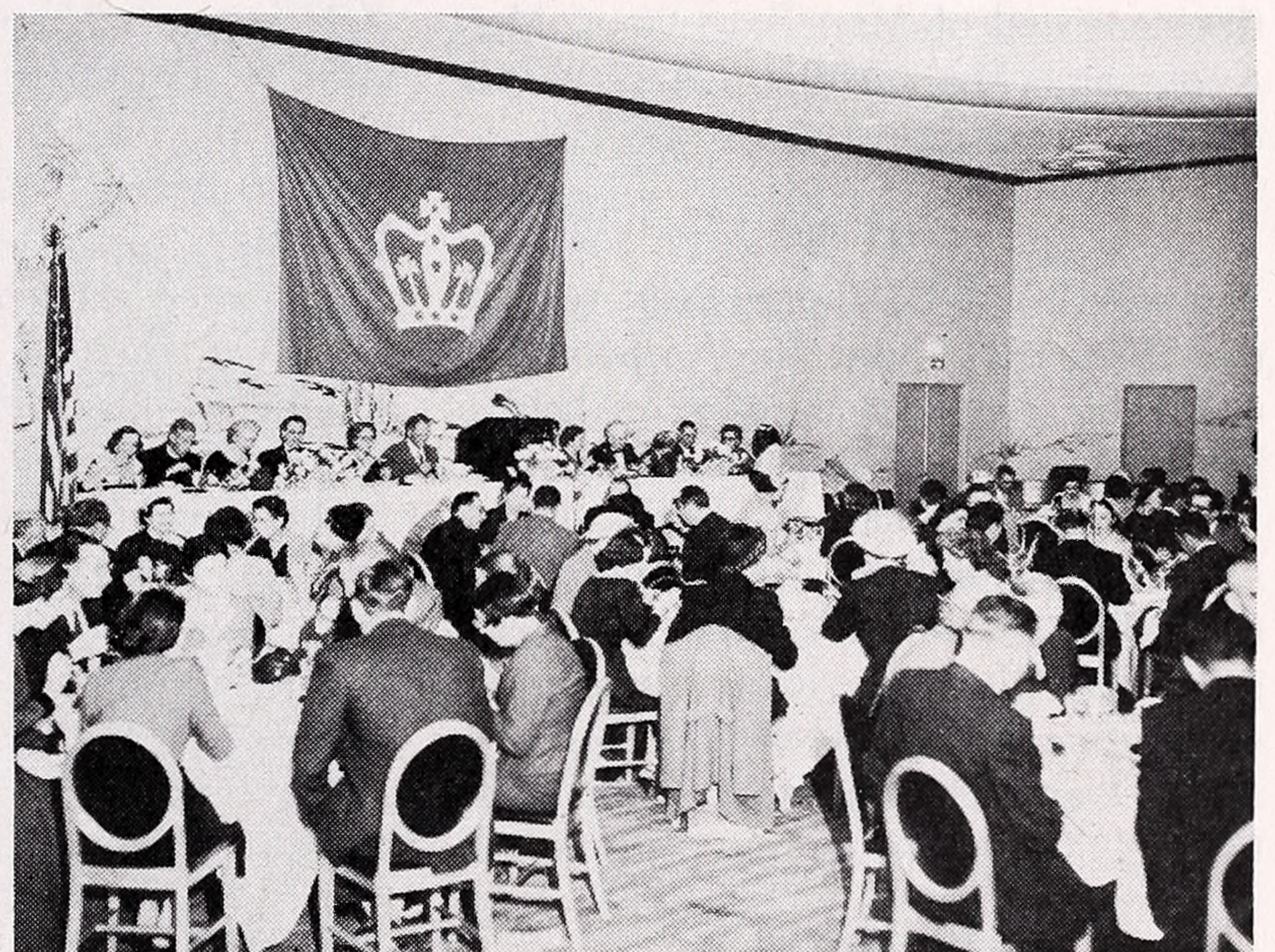
On her trip, President made five speeches in Dallas; one was at North Texas Columbia Bicentennial Dinner