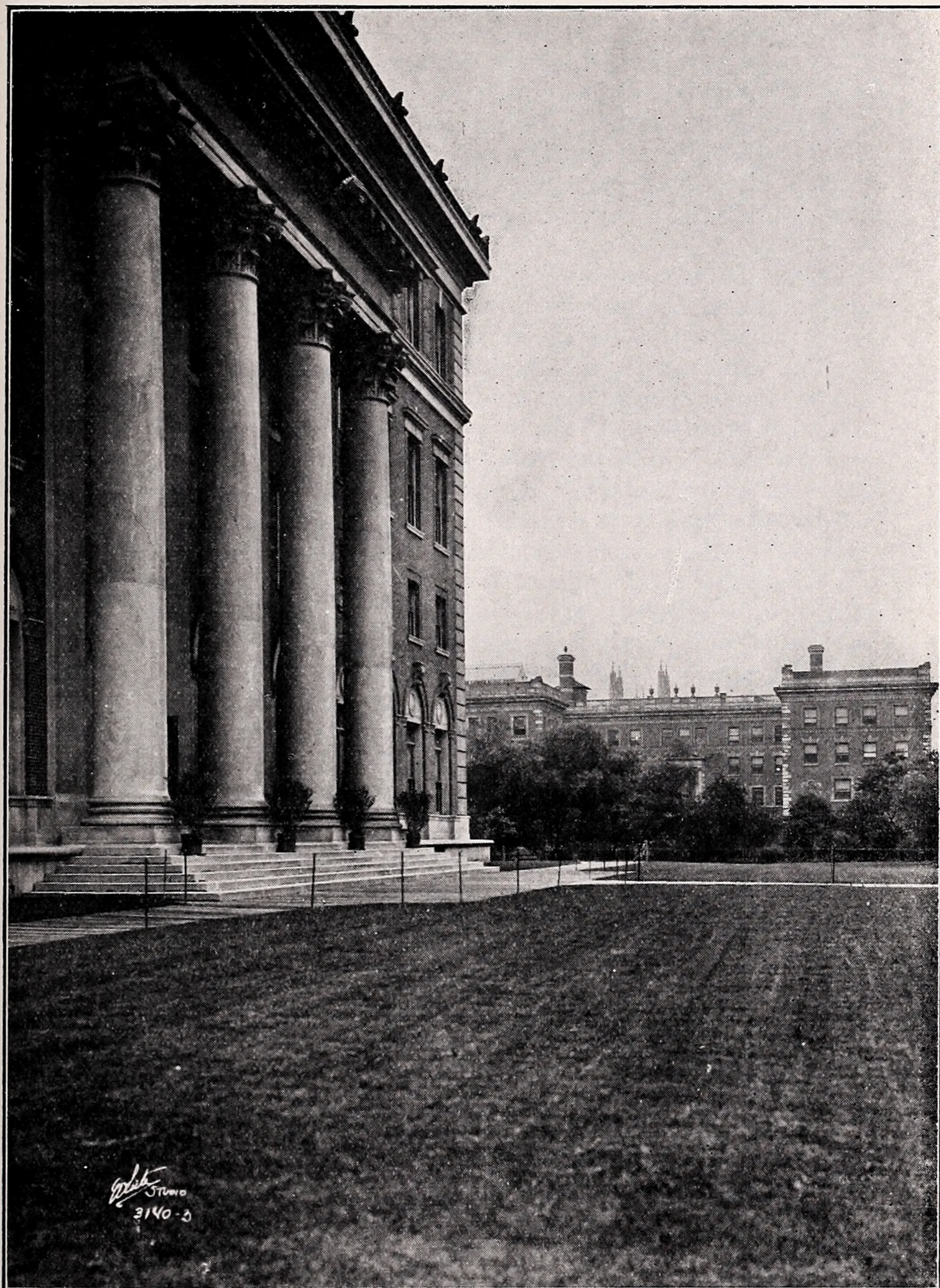
“THERE IS A COLLEGE ON BROADWAY” BARNARD FROM STUDENTS HALL