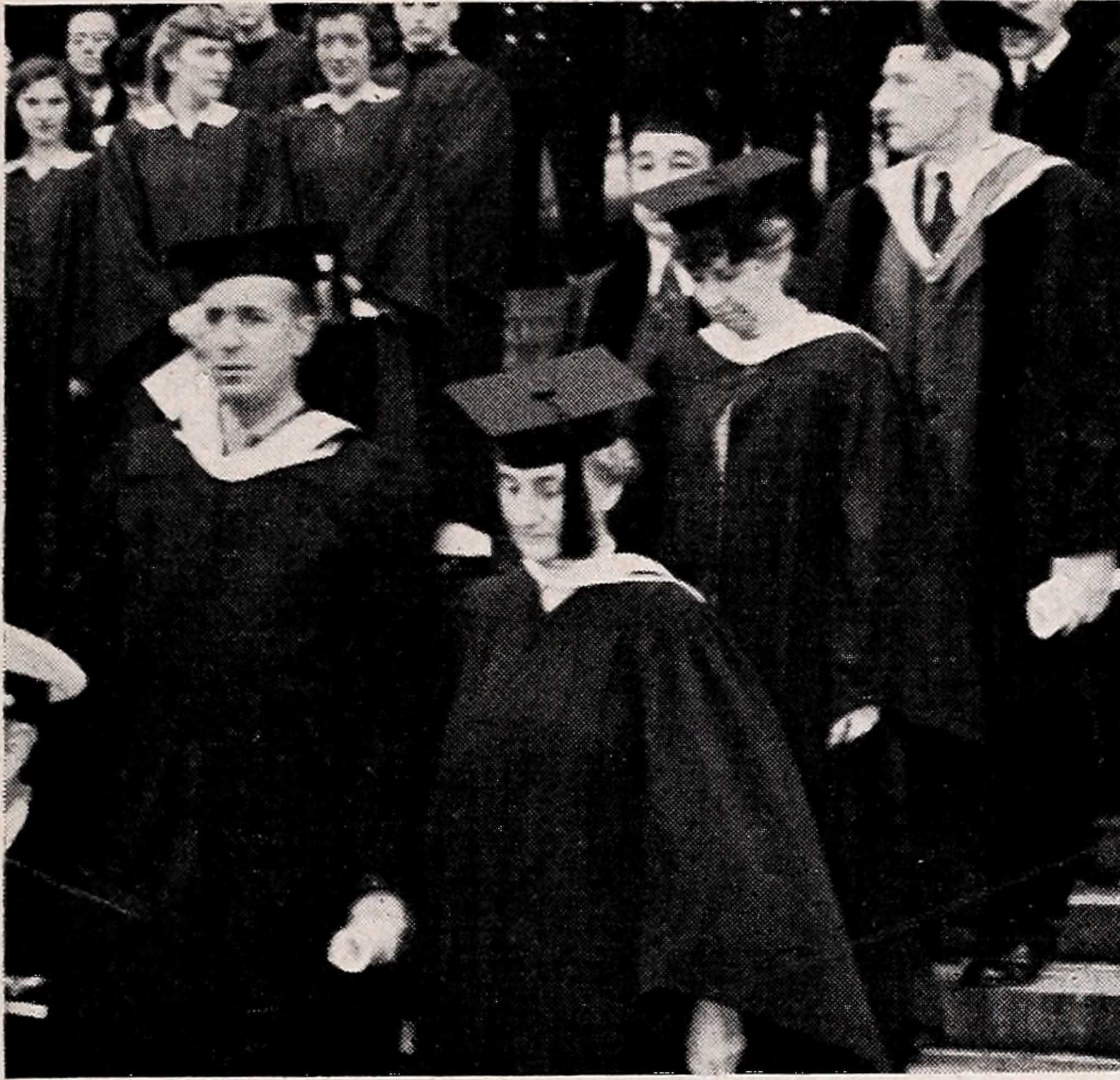
We focus on the Academic Procession