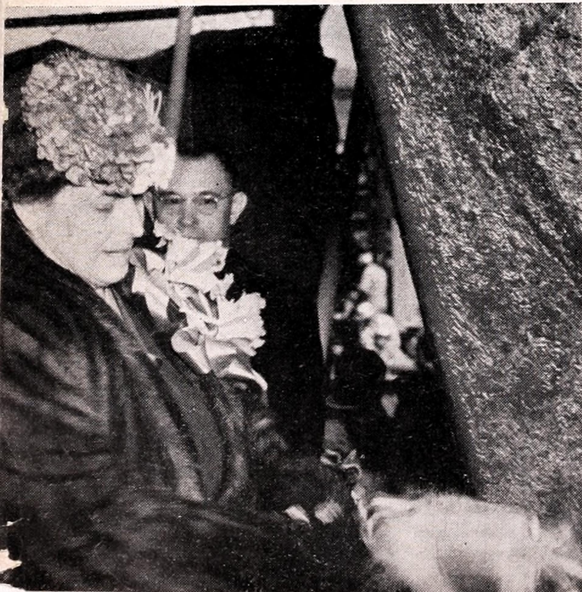
"I christen thee S. S. BARNARD VICTORY!"